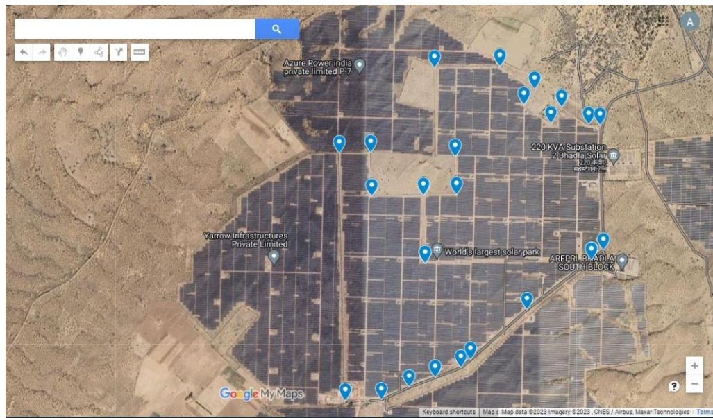
Figure 2 Entire project Location on Google maps