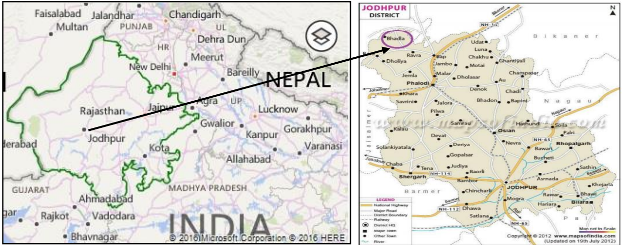
Figure 1. State and district Map of Rajasthan and Jodhpur