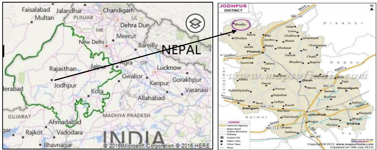
Figure 1. State and district Map of Rajasthan and Jodhpur