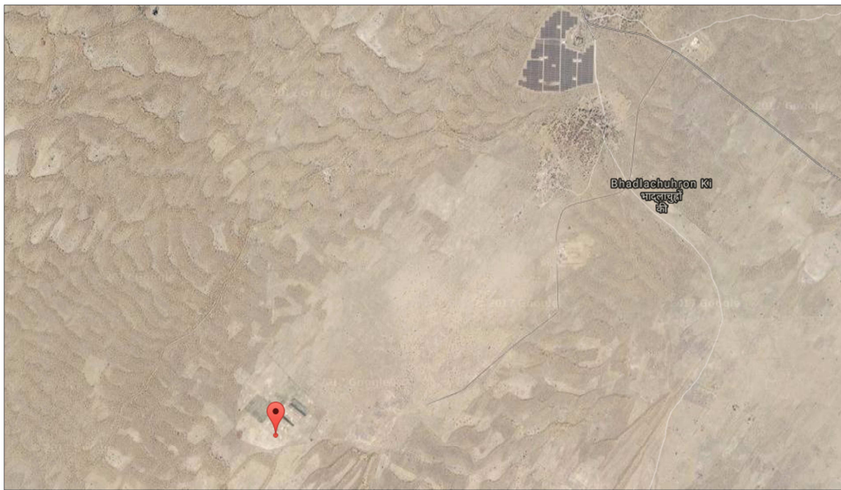
Figure 2 Pin point drop on Google maps