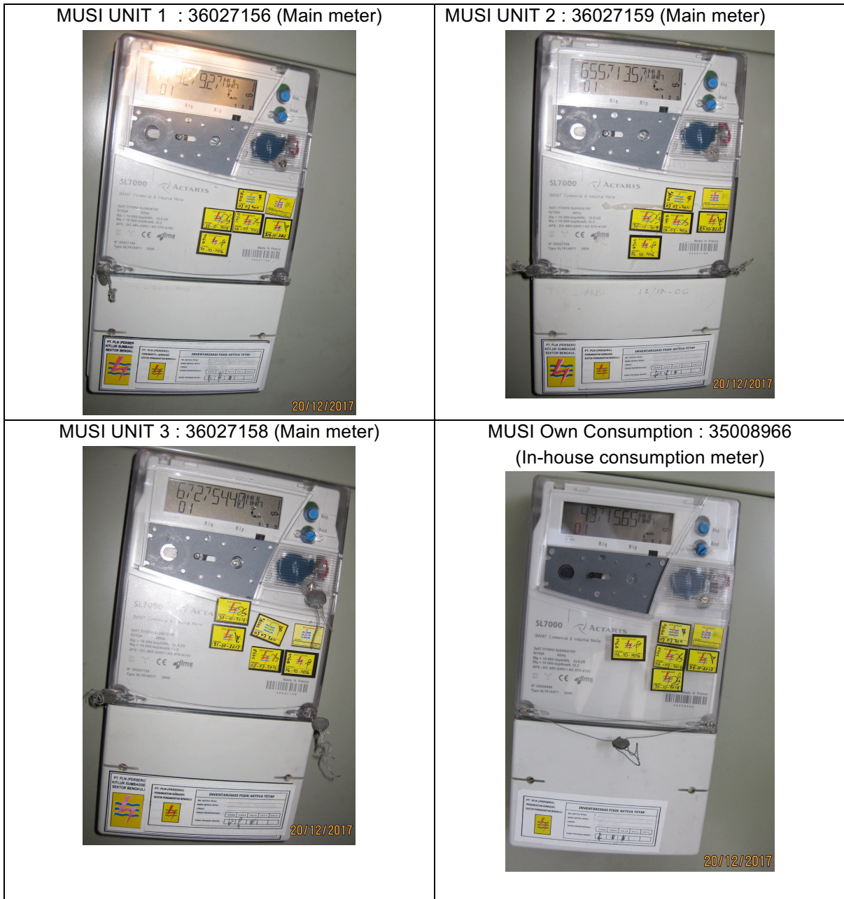
Figure 2 - Picture of main meters and own consumption meter (in-house consumption)

Picture of the main meters and own consumption meter (in-house consumption) are shown below: