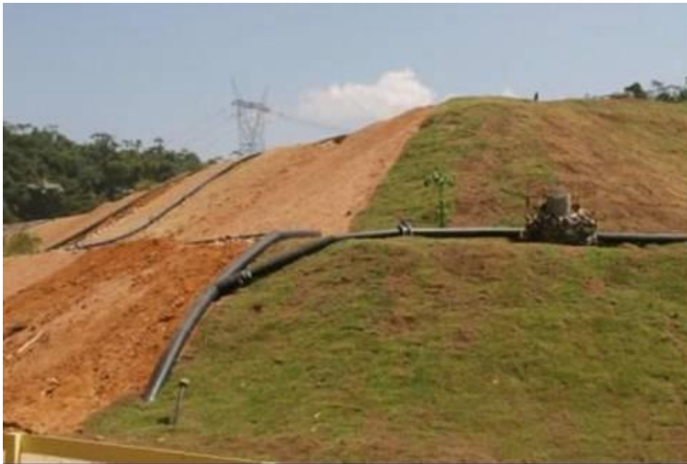
Figure 1 Example of LFG collecting system. The image above refers to the system implemented on CTR Nova Iguaçu, operated by Haztec Tecnologia e Planejamento Ambiental S.A. (HAZTEC).