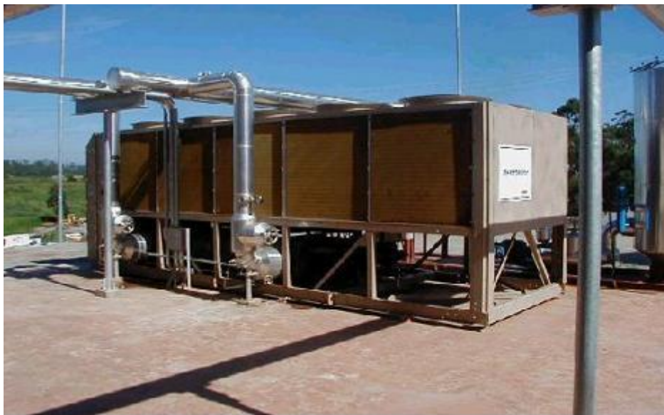
Figure 2 Example of LFG pre-treatment system. The image above refers to the system implemented on Bandeirantes Landfill – located in São Paulo state, and operated by BIOGAS

All LFG collected will be pre-treated to remove moisture and other impurities in order to prevent the corrosion of the subsequent systems (flare system, electricity generators and LFG upgrading station).