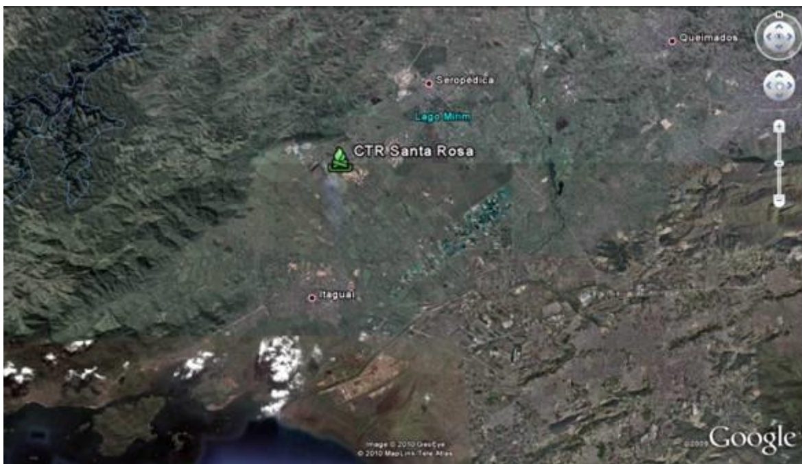
Figure 6 - Exact location of CTR Santa Rosa, located between Seropédica and Itaguaí municipalities.