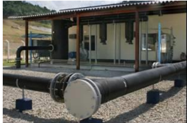
Figure 3 Example of flaring system to be installed. The image above refers to the flaring system implemented on CTR Nova Iguaçu, also operated by Haztec.