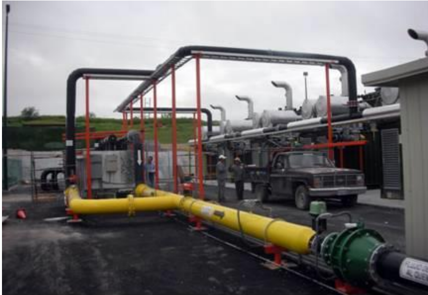
Figure 4 Example of modular electricity generation facility to be implemented in this project. The image above was obtained from Monterrey Landfill, Mexico.