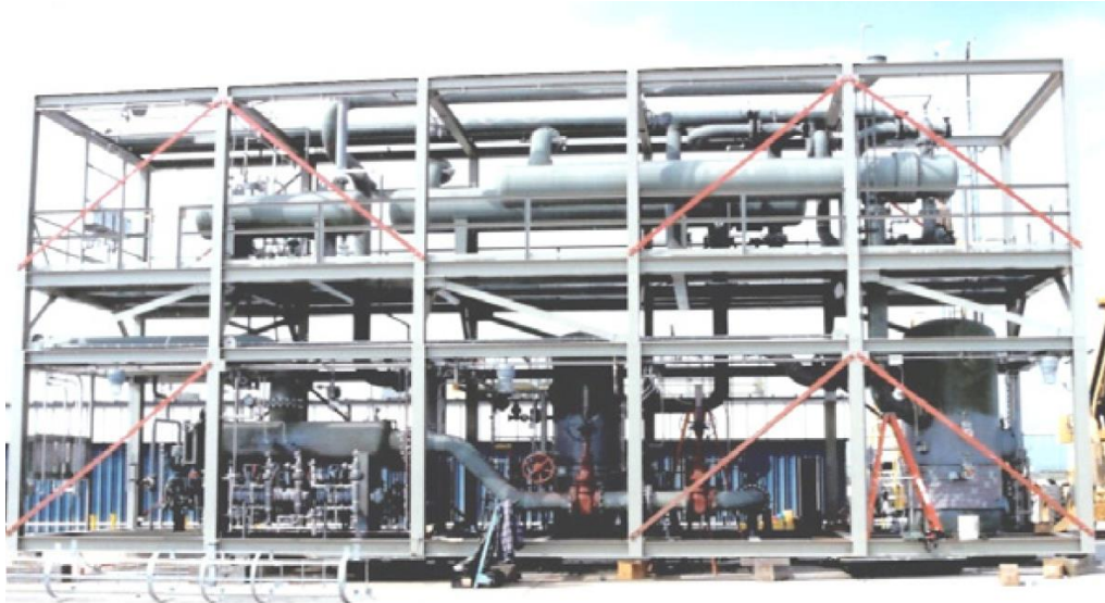
Figure 5 Example image of the upgrading station to be implemented in CTR Santa Rosa.