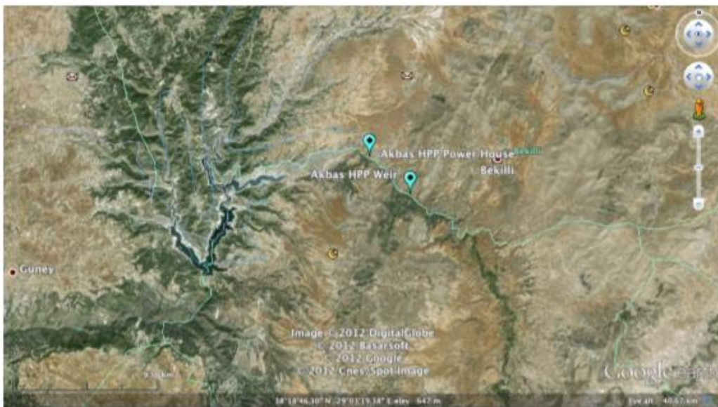
Figure 3. Google Earth view showing the location of the project area within Turkey (above) and in the Aegean region .

The project lies between 29°21' 34" and 29°19'36" Eastern Longitudes and Between 38°12' 25" and 38° 13' 44" Northern Latitudes.