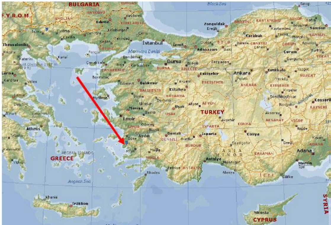
Figure 1. Project Location on Turkey Map