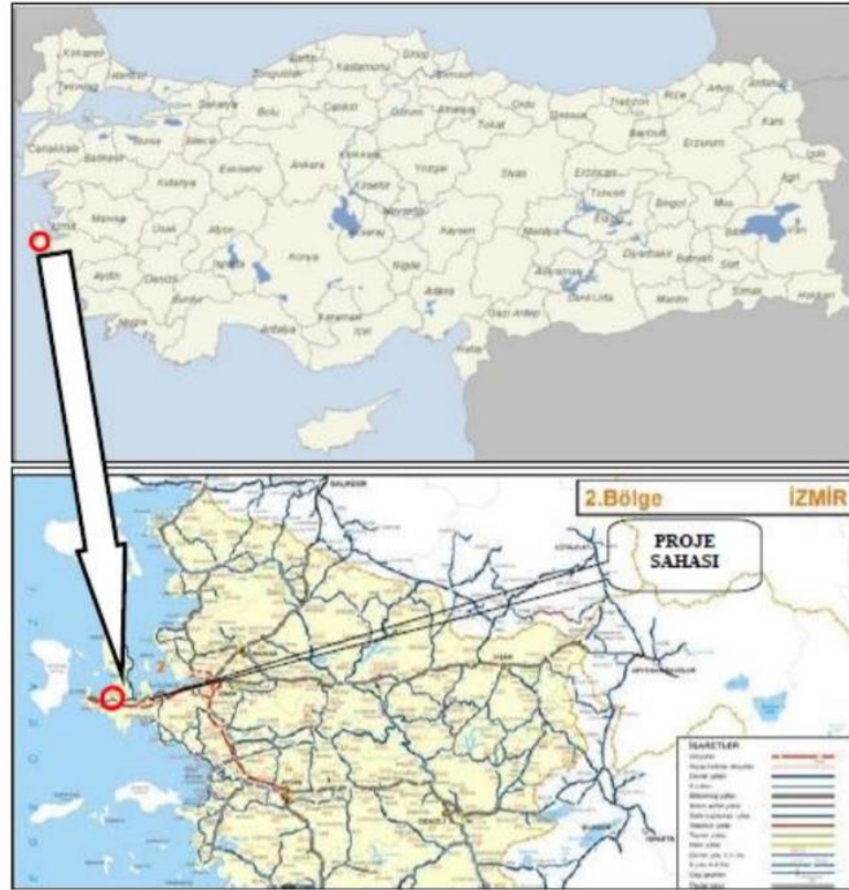
Figure 1. Location of Alaçatı Wind Power Project