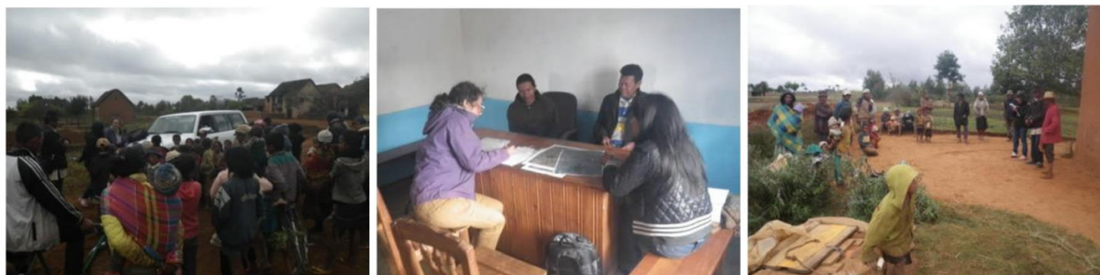
Figure 2: Pictures of the stakeholder meetings