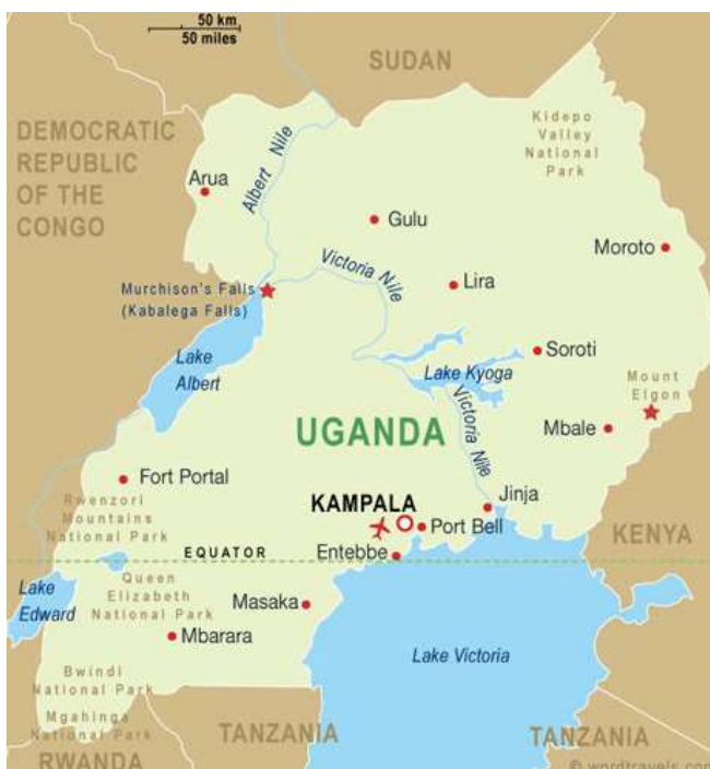
Figure 1: Geographical boundary of Uganda and the VPA.

The co-ordinates of Uganda are represented approximately by: 4°12'53.79" to -1°28'19.22" N, 29°34'17.52" to 35°2'33.81" E.