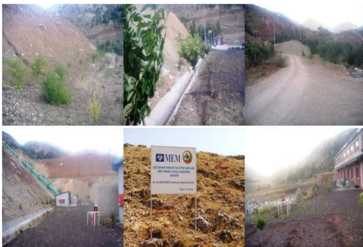
Figure: Afforestation Activities