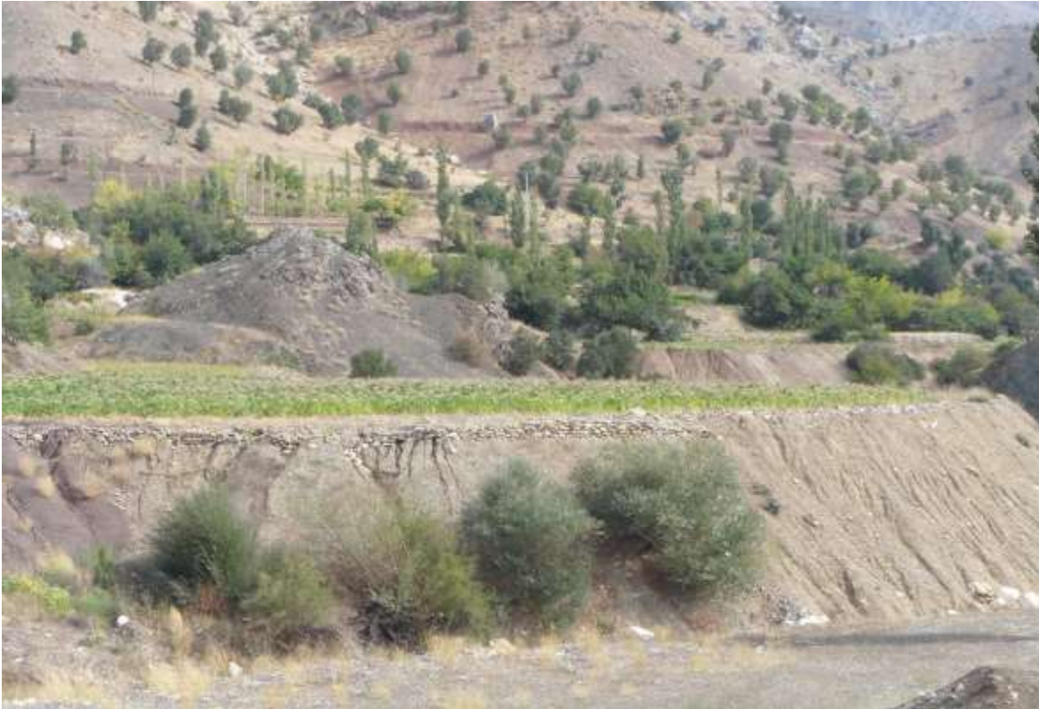
Figure. Proper storage and use of aggregates from excavation Works at the Project site. Planting trees helps to take precautions against erosion problem