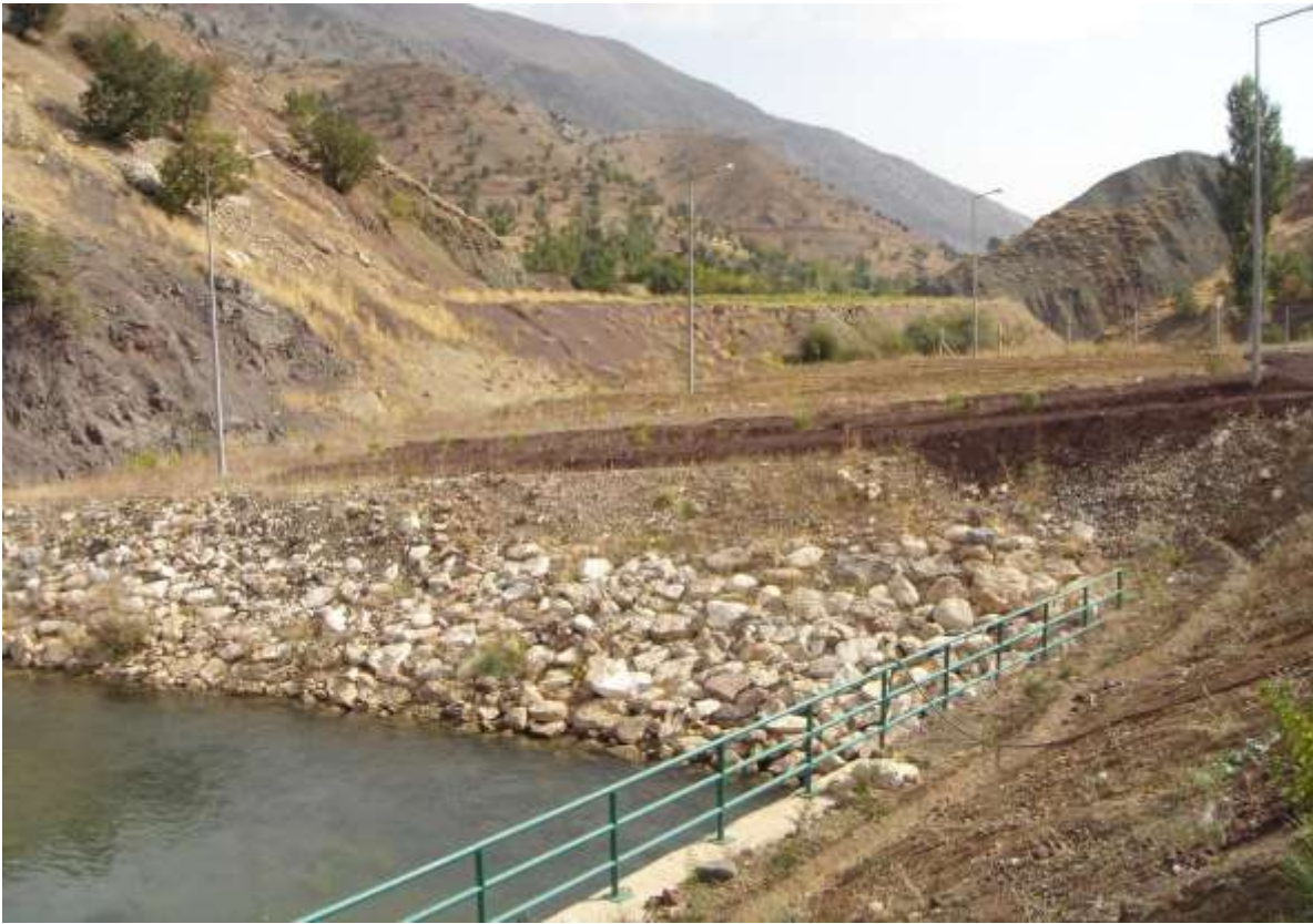
Figure. Proper storage and use of aggregates from excavation Works at the Project site. Planting trees helps to take precautions against erosion problem