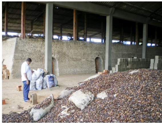
Figure 6. Cashew nut shells stored prior to use as fuel in Ceagra Ceramic.