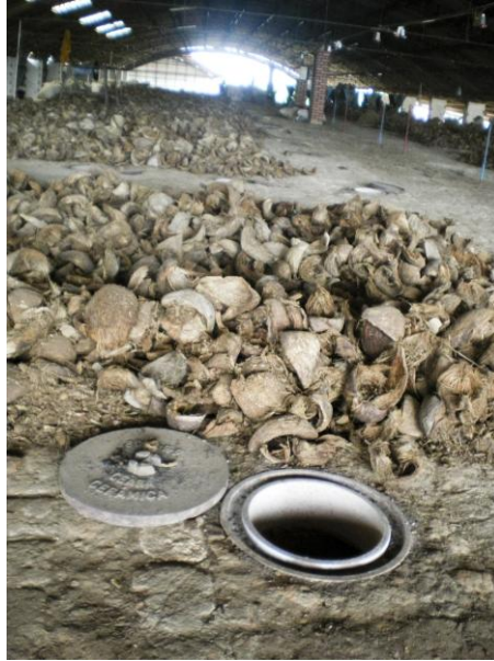
Figure 7. Hoffmann kiln being fed with renewable biomass (coconut residues) in Eliane Ceramic.