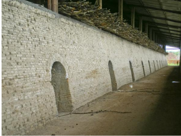
Figure 5. Hoffmann kiln being fed with renewable biomass in Ceagra Ceramic.