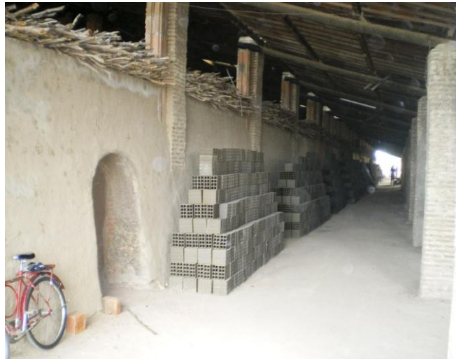
Figure 9. Hoffmann kiln being fed with renewable biomass in Santa Rita Ceramic.

This project activity will reduce the greenhouse gases (GHG) emissions through the substitution of non-renewable biomass for renewable biomasses to generate thermal energy. As renewable biomasses, the project activity will utilize mostly biomass residues (such as cashew nut shells, residues from cashew tree, coconut husk) and wood from sustainable forest management plan areas to feed the ceramic’s kilns. The project will also involve energy efficiency measures, such as improved fuel handling and kilns improvement to reduce the necessary energy per production output 6 .