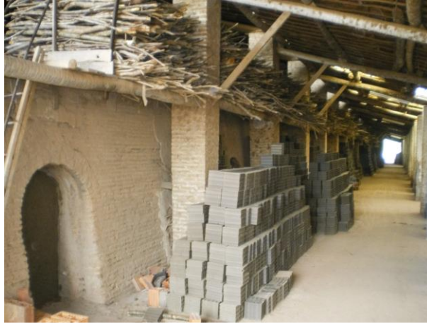
Figure 1. Hoffmann kiln being fed with renewable biomass in Antônio Ceramic.