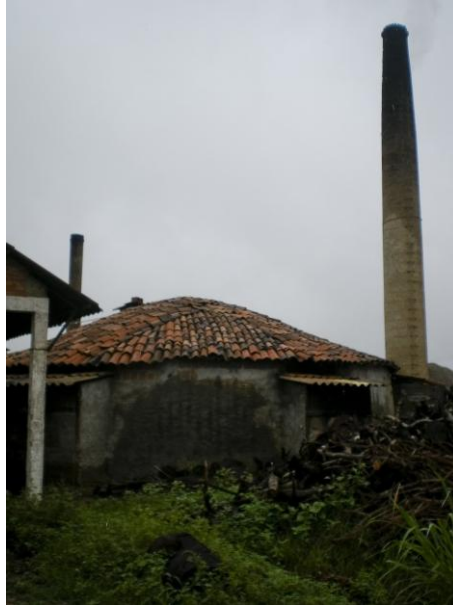
Figure 3. Round kiln at Ceará Ceramic.