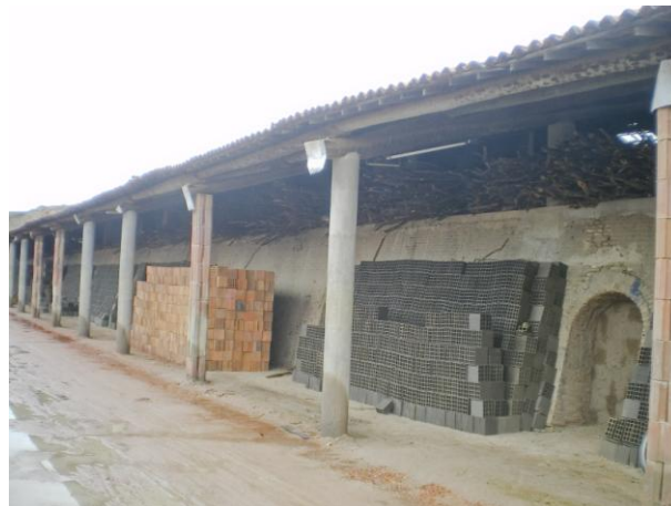
Figure 4. Hoffmann kiln being fed with renewable biomass in Ceará Ceramic.