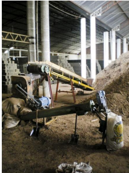
Figure 8. Biomass being processed to used as fuel in Eliane Ceramic.