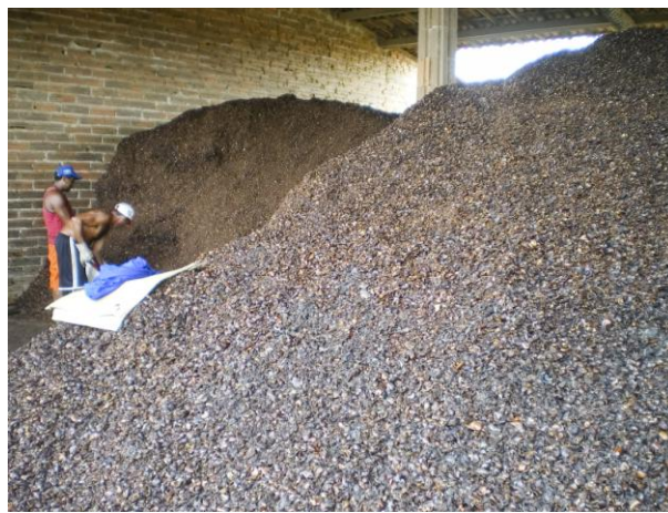
Figure 2. Cashew nut shells stored prior to use as fuel in Antônio Ceramic.