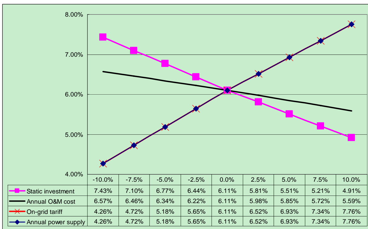
Figure 2 shows that, with the critical variables in the \pm 10\% range, the calculated IRR of the proposed project is unlikely to reach the benchmark 8%. Therefore, the proposed project is not financially feasible without the revenue of CERs under any reasonable variation of the critical parameters.

→ If after the sensitivity analysis it is concluded that the proposed CDM project activity is unlikely to be the most financially attractive (as per step 2c para 8a) or is unlikely to be financially attractive (as per step 2c para 8b), then proceed to Step 3 (Barrier analysis) or Step 4 (Common practice analysis).