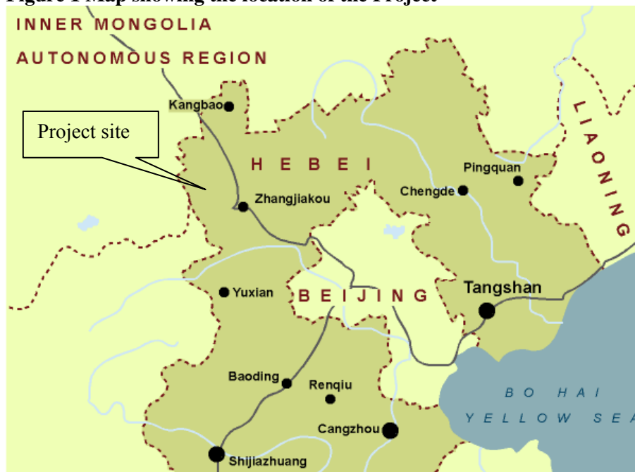
Figure 1 Map showing the location of the Project

The proposed Windfarm is located in the southwest of Zhangbei County. It is located longitude 114°33'4" East to 114°37'23" East and latitude 41°07'22" North to 41°10'36" North. The altitude of the site ranges from 1422m to 1562m above mean sea level. Figure 1 shows the location of the project.