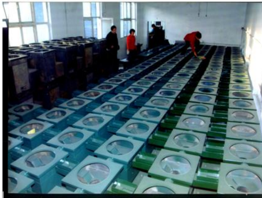
Figure 2. Workers are assured a steady workflow, and a steady income, as a result of the business development introduced by the project proponents. Pictured here is newly implemented production quality control that examines combustion body linings to ensure no cracks exist in the clay combustion chambers, which could lead to poor stove performance.

In addition to business development, this project has provided many ancillary benefits in Shanxi province. Locally, the project has provided employment for significant numbers of workers, office staff and field technicians. The