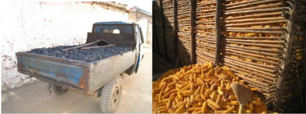
Figure 4. Left: Raw coal being delivered and sold for cooking and heating in rural Shanxi. Right: Household corn yield being dried before the kernels are removed for sale. The remaining corn cobs will be saved for use with the Jinqilin stove.

The project introduces environmental benefits through reduced fossil fuel coal use. The dissemination of high-efficiency cooking stoves, in a province in which over 80% of the population cooks with traditional stoves and coal fuels, is an example of the kind of solution that is needed to address increasing trends of fossil fuel usage.