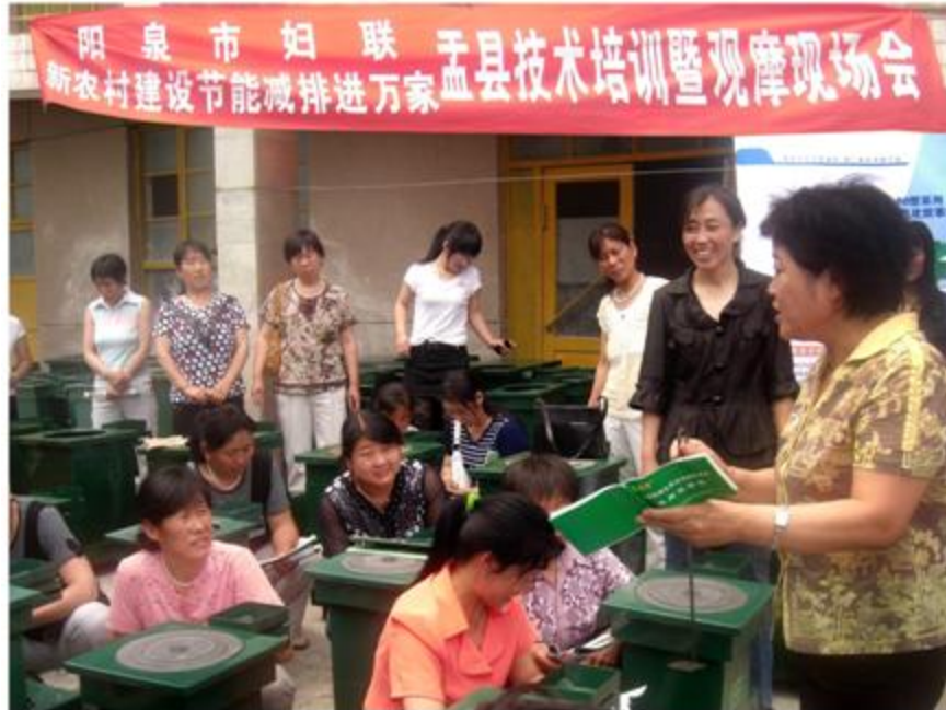
Figure 1. Village level stove usage training ensures proper use, combined with overall improved customer service, increases the trust and reputation of the Jinqilin Company.