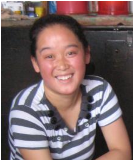
Figure 8. “I was one of the first persons to get a Jinqilin stove 4 years ago. Through a government subsidy program I was able to buy it for a good price. Before the stove, we would throw away our corn cobs. We had no use for them, so we burned them in the fields to get rid of them. Now we save our corn cobs and use it for fuel with our Jinqilin stove. It is so fast and easy to use, much better than the long wait time for our old coal stove. But what I like most about the stove, besides the convenience, is that since buying the stove I’ve saved so much money from not having to buy coal for cooking. It is wonderful, every home in our Shanxi should have one.”

Once a family owns a stove, reduced coal consumption (and the subsequent financial savings and other benefits for families using Project Stoves) are evident social benefits of this project as well. In Shanxi, where low-income families spend as much as 12% of annual income on cooking fuels, the cost savings are immense: families using the Jinqilin stove can save an average of ¥1,961 RMB (US$319) per year. Users provide positive feedback on the stove: