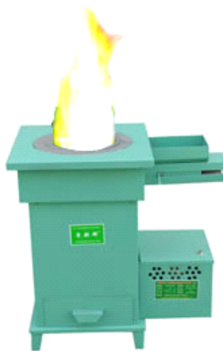
Jinqilin Stove (Shanxi)