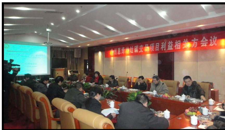
Figure 4. Stakeholders in Guizhou participate in a local stakeholder meeting. Overwhelmingly, stakeholders continue to provide positive feedback and are eager for carbon finance to increase rural residents' ability to access and benefit from these efficient technologies.

Both of these new Project Manufacturing Partners have developed quality control systems as well as mechanisms for customer support. In the last year, both Zhiqi and Huifeng were able to invest in additional and more advanced manufacturing equipment, which enables improved stove quality, as well as additional human capacity. Both Partners were also able to engage in market development activities, such as participating in stove exhibitions and demonstrations and gaining media exposure.