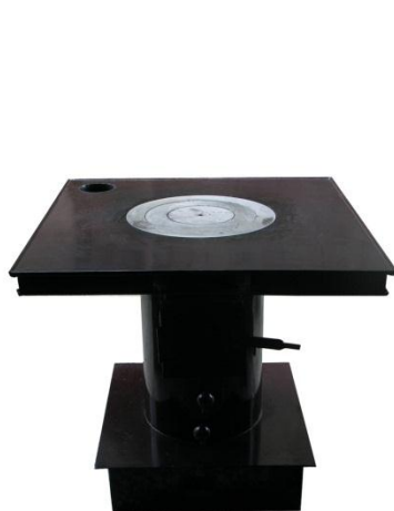
Huifeng Stove (Guizhou)

Submitted by Impact Carbon on behalf of Project Stove Manufacturers with assistance from MyClimate and local partner, China Association for Rural Energy Industries (CAREI)