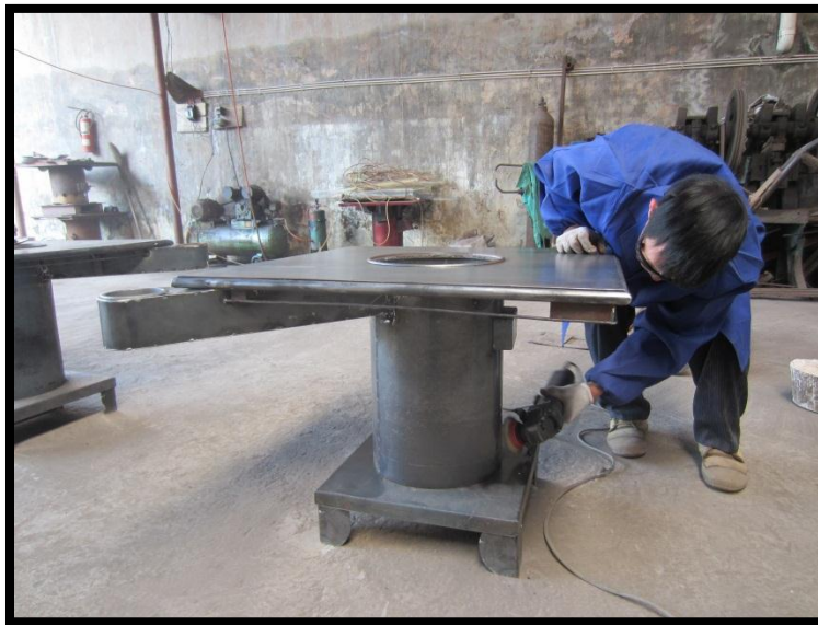
Figure 6. Workers are provided with a steady workflow, and a steady income, as a result of the business development introduced by the project proponents. Pictured here is an artisan crafting the Zhiqi stove.

In addition to business development, this project provides many ancillary benefits in Shanxi, Guizhou and Enshi. Locally, the project provides employment for significant numbers of workers, office staff and field technicians, and continues to do so as the companies grow - Zhiqi employed 22 employees in this monitoring period, Huifeng employed 47 employees, and Jinqilin employed 35 employees 7 . The program aims to reach underprivileged families, which normally cannot afford improved stoves, by subsidizing the manufacture and sale of high quality, long lasting stoves with financial subsidies. This is an opportunity that was not previously viable without carbon finance to help cover project implementation expenses during the credit period. This becomes increasingly true as the cost of raw materials and other manufacturing expenses rise – carbon finance is thus an integral component in both ensuring low-income families’ ability to afford and access the stoves and providing opportunity for Manufacturing Partners’ growth and scale.