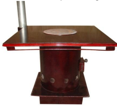
Figure 2. Technical specifications for Zhiqi biomass gasifier stove