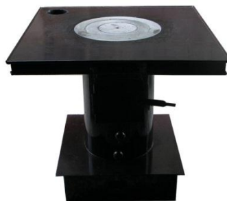
Figure 3. Technical specifications for Huifeng biomass gasifier stove

The Huifeng improved stove is classified as “semi-gasifier,” but here after shortened to “gasifier.” This gasifier is manufactured by Anshun Huifeng Energy Saving Stove Company Ltd and features carefully engineered airflow and insulated combustion chambers to burn woods and biomass residues cleanly and efficiently. The thermal efficiency for combined heating and cooking in laboratory testing using biomass residues for the Huifeng stove model HF-CS is 88.7% against the Standard GB/T 16157-1996, HJ/T398-2007 and DB11/T540-2008.