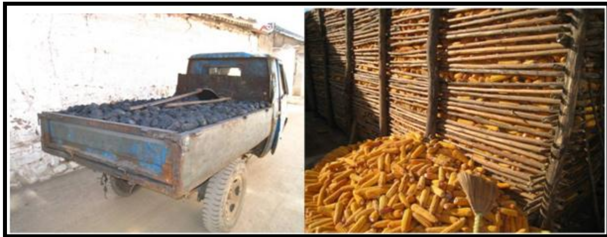
Figure 9. Above Left: Raw coal being delivered and sold for cooking and heating in rural Shanxi. Above Right: Household corn yield being dried before the kernels are removed for sale. The remaining corn cobs will be saved for use with the Jinqilin stove.

Project proponents have taken steps to prepare Manufacturing Partners for sustainable growth that could meet the future projected demand for stoves. First, the project proponents assisted with developing a monitoring and tracking system for stove sales. This has allowed Manufacturing Partners to better prepare for potential future cost barriers, as well as more accurately track customer locations and needs. With respect to the latter, the project proponents are assisting with the development of a customer service and technical maintenance division at the factories. This new division will help to ensure quality follow-up is available for both village level customer training as well as technical training related to maintenance issues. This new division addresses an important barrier to systemically changing fuel use in coal-rich Shanxi, which is the lack of a concerted and sophisticated customer service operation to create market trust and technological reliability.