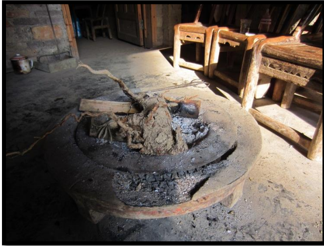
Figure 7. Traditional coal heating practices in Guizhou Province result in black stained kitchen floors from cooking indoors with coal fuels.

Reduced coal consumption, and subsequent cost savings for regular families using Jinqilin, Zhiqi and Huifeng stoves is a significant social benefit of this project. Families spend between 10% and 14% of their annual income and 14% to 17% of their total living expenditures on cooking fuels in rural settings in Shanxi, Enshi, and Guizhou. 8