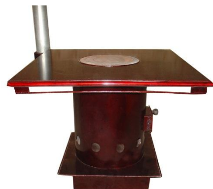
Zhiqi Stove (Enshi)