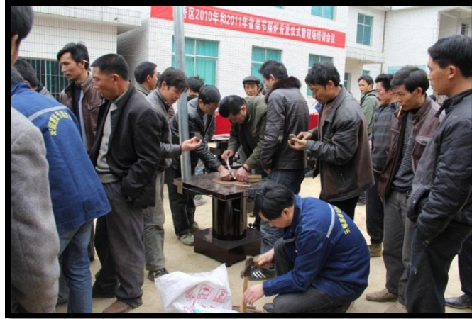
Figure 5. Village level stove usage training ensures proper use, combined with overall improved customer service, increases the trust and reputation of the Manufacturing Companies. Depicted here is a Huifeng user training in Guizhou Province.