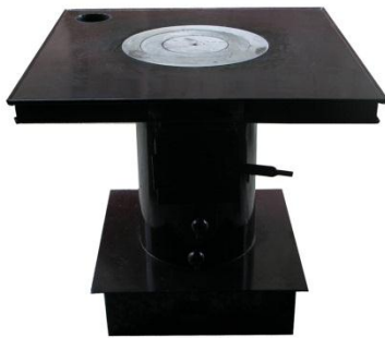
Huifeng Stove (Guizhou)

Submitted by Impact Carbon on behalf of Project Stove Manufacturers with assistance from MyClimate and local partner China Association for Rural Energy Industries (CAREI)