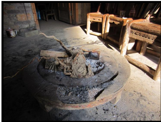
Figure 4. Traditional coal heating practices in Guizhou Province result in black stained kitchen floors from cooking indoors with coal fuels.

In addition to business development, this project provides many ancillary benefits in Shanxi, Guizhou and Enshi provinces. Locally, the project provides employment for significant numbers of workers, office staff and field technicians, and continues to do so as the companies grow - Zhiqi employed 12 employees in the past year, Huifeng employed 20 employees, and Jinqilin employed 18 employees. The program aims to reach underprivileged families, which normally cannot afford improved stoves, by subsidizing the manufacture and sale of high quality, long lasting stoves with financial subsidies. This is an opportunity that was not previously viable without carbon finance to help cover project implementation expenses during the credit period. This becomes increasingly true as the cost of raw materials and other manufacturing expenses rise – carbon finance is thus an integral component in both ensuring low-income families’ ability to afford and access the stoves and providing opportunity for Manufacturing Partners’ growth and scale.