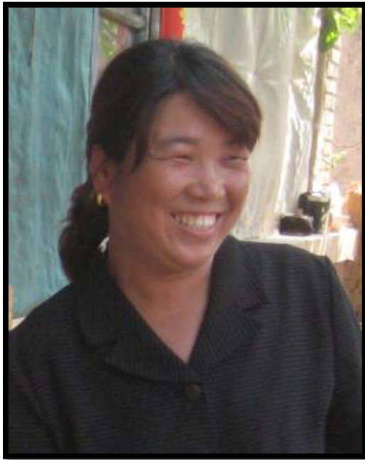
Figure 5. "I live with my husband, son (17yrs) and daughter (15yrs). My husband and I are farmers in Xiaohu village of Shanxi province. Our children are good students, and our greatest hope is that they can continue their schooling. In our hometown in Yangquan City, middle school is free, but the county high school and university cost money. We save as much as possible so we can afford the school fees, clothes and better food for our children. The Jinqilin stove has helped us save extra money because we no longer have to buy coal for cooking. Even though this area of Shanxi has many coal mines, coal prices are still very expensive, especially for farmers like ourselves. Since getting the stove in 2008, we've been able to save so much money. This stove is helping us afford an education for our children."

Once a family owns a stove, reduced coal consumption (and the subsequent financial savings and other benefits for families using Project Stoves) are evident social benefits of this project as well. In Shanxi, where low-income families spend as much as 15% of annual income on cooking fuels, the cost savings are immense: families using the Jinqilin, which reduce fuel use by 41.4% compared to traditional cooking methods, can save more than ¥2,609 RMB (US$412) per year. In Guizhou and Enshi provinces, the thermal efficiencies are 88.7% and 81.5%, respectively. Users provide positive feedback on the stove: