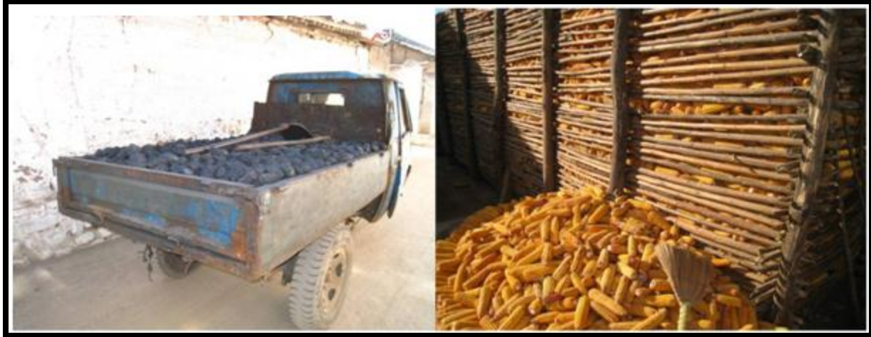
Figure 6. Above Left: Raw coal being delivered and sold for cooking and heating in rural Shanxi. Above Right: Household corn yield being dried before the kernels are removed for sale. The remaining corn cobs will be saved for use with the Jinqilin stove.

Several new initiatives are planned to improve the customer service division: