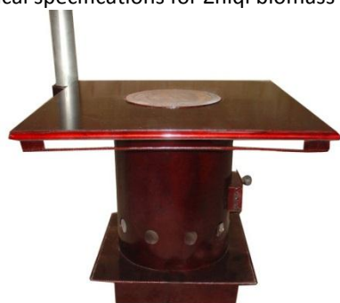
Figure A5. Technical specifications for Zhiqi biomass gasifier stove