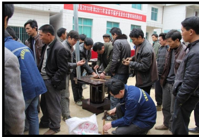
Figure 2. Village level stove usage training ensures proper use, combined with overall improved customer service, increases the trust and reputation of the Manufacturing Companies. Depicted here is a Huifeng user training in Guizhou Province.

Manufacturing Partners will continue to undergo regular recordkeeping spot checks and will receive regular business development support and feedback from the Project as part of capacity building and maintaining rigor of data quality.