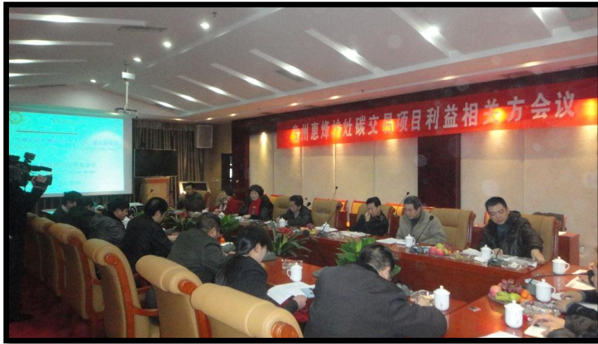
Figure 1. Stakeholders in Guizhou participate in a local stakeholder meeting. Overwhelmingly, stakeholders continue to provide positive feedback and are eager for carbon finance to increase rural residents' ability to access and benefit from these efficient technologies.

Both of these new Project Manufacturing Partners have begun to develop quality control systems as well as mechanisms for customer support. In the last year, both Zhiqi and Huifeng were able to invest in additional and more advanced manufacturing equipment, which enables improved stove quality, as well as additional human capacity. Both Partners were also able to engage in market development activities, such as participating in stove exhibitions and demonstrations and gaining media exposure.