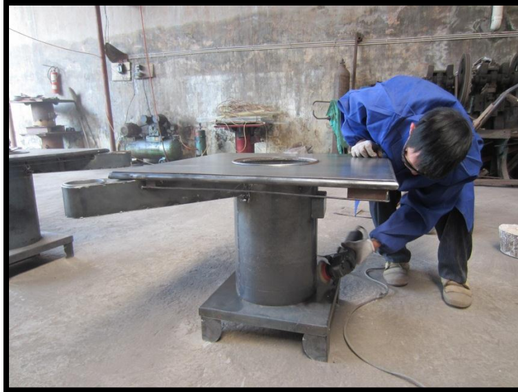
Figure 3. Workers are provided with a steady workflow, and a steady income, as a result of the business development introduced by the project proponents. Pictured here is an artisan crafting the Zhiqi stove.

In addition to business development, this project provides many ancillary benefits in Shanxi, Guizhou and Enshi provinces. Locally, the project provides employment for significant numbers of workers, office staff and field technicians, and continues to do so as the companies grow - Zhiqi employed 12 employees in the past year, Huifeng employed 20 employees, and Jinqilin employed 18 employees. The program aims to reach underprivileged families, which normally cannot afford improved stoves, by subsidizing the manufacture and sale of high quality, long lasting stoves with financial subsidies. This is an opportunity that was not previously viable without carbon finance to help cover project implementation expenses during the credit period. This becomes increasingly true as the cost of raw materials and other manufacturing expenses rise – carbon finance is thus an integral component in both ensuring low-income families’ ability to afford and access the stoves and providing opportunity for Manufacturing Partners’ growth and scale.