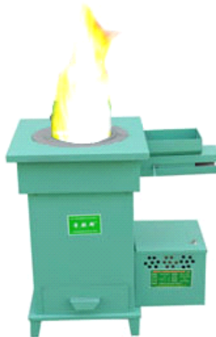
Jinqilin Stove (Shanxi)