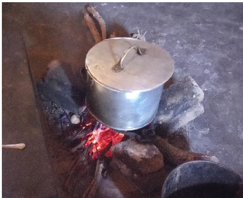
Image of a traditional 3-stone fire captured during the baseline survey

It was established from these surveys that all participants used wood as a fuel source with 100% of participants indicating as such. All the participants indicated that they make use of a traditional 3-stone fire for cooking.