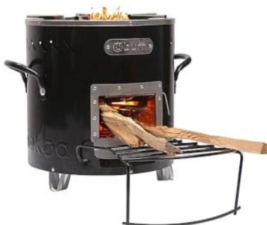
Burn Kuniokoa model cookstove

As an example, this VPA has commenced the distribution of the Kuniokoa wood fuel cookstoves manufactured by Burn Manufacturing LLC. This cookstove delivers a thermal efficiency of 41.6% according to an independent lab report from the Kenya Industrial Research and Development Institute (KIRDI) of 19th November 2017.