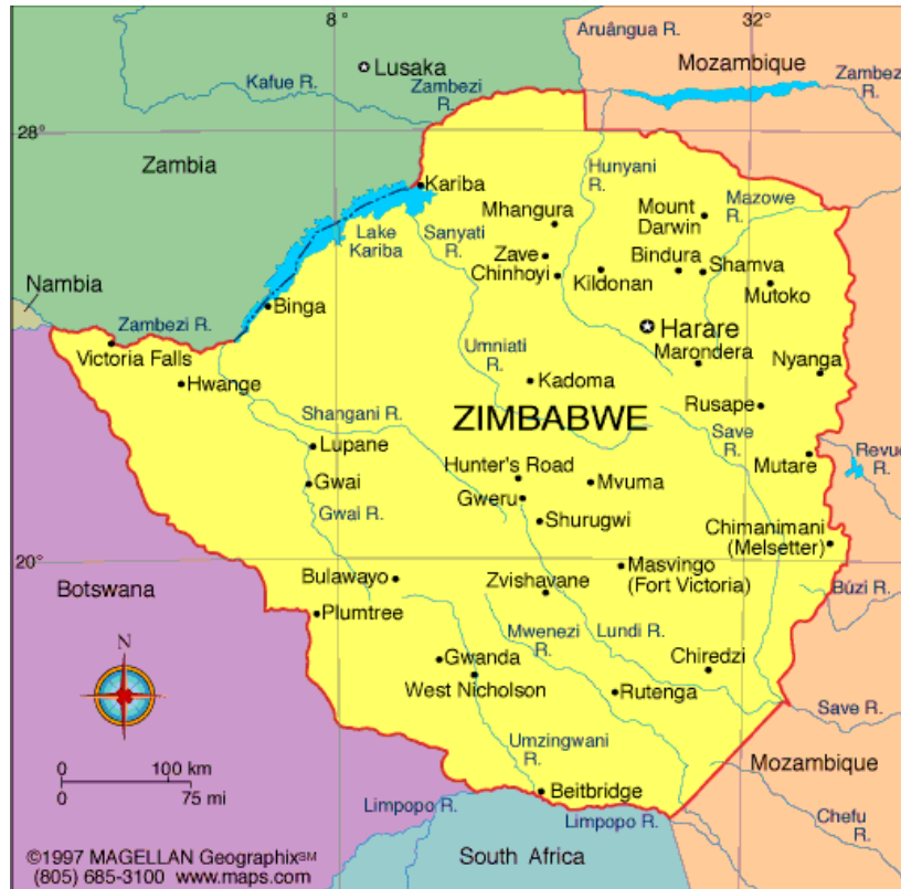
Zimbabwe map and provinces

The VPA is implemented across Zimbabwe and not limited to any specific provinces. The GPS coordinates of Zimbabwe are 19.0154° S, 29.1549° E