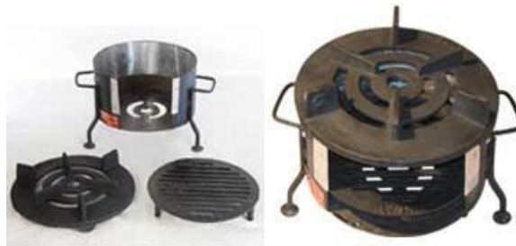
Figure 2: Improved Cook stove

Material used for manufacturing of each component of the cook stoves are: