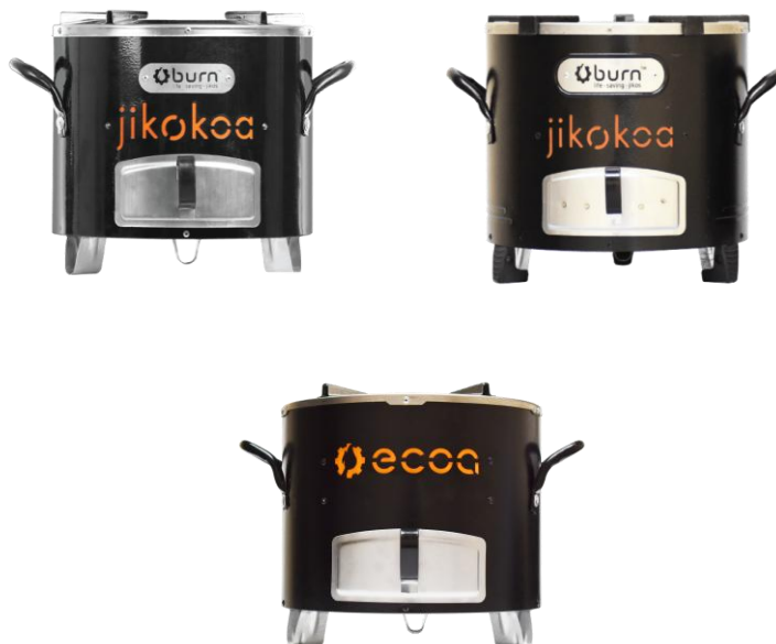
Photos: To the top left: Jikokoa Classic (G3.5), To the top right: Jikokoa Xtra, To the bottom: ECOA Char MMJ

Each ICS will be identified through a unique serial number (USN). The USN has the following format comprising of 9 digits 8 :