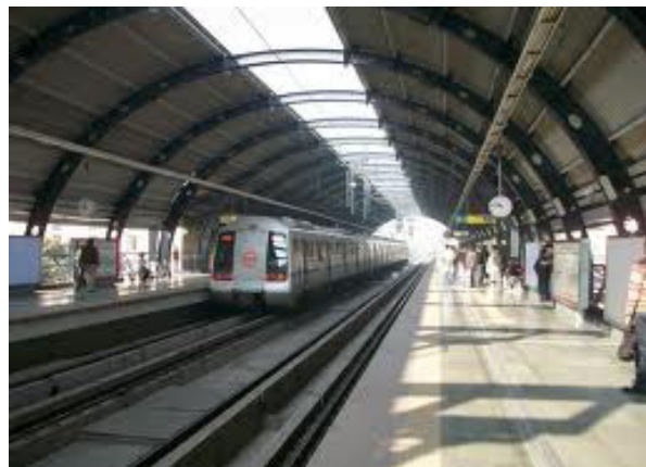
Figure 2: Maximum daylight utilization in stations