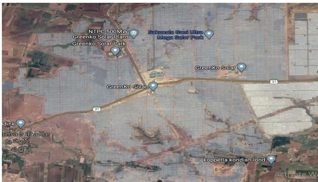
Figure 1 Satellite Project locations