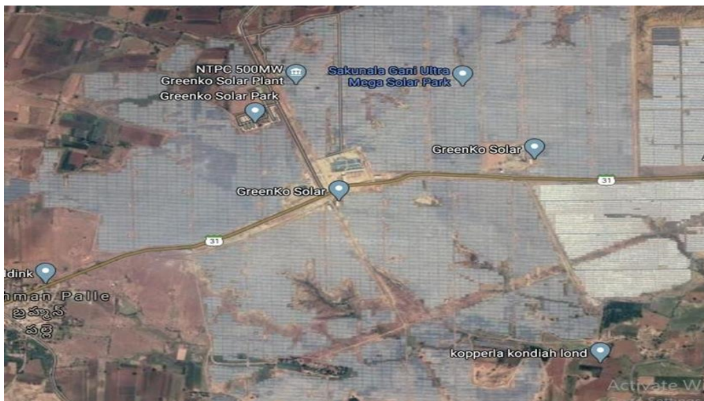
Figure 1 Satellite Project locations