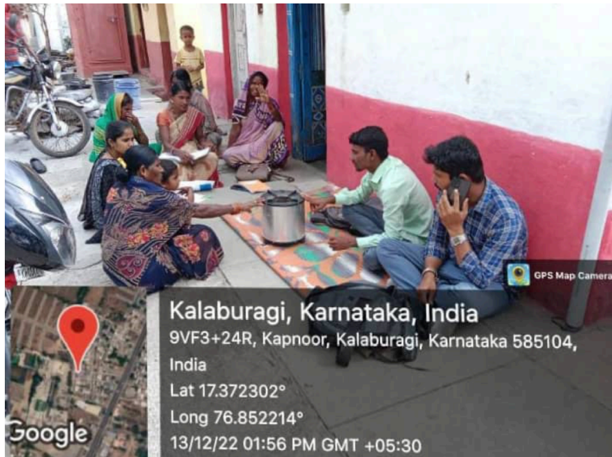
Picture of the stakeholder meeting conducted on 13/12/22, at Kalaburagi