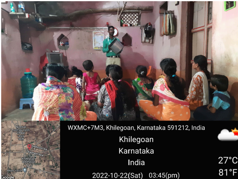
Picture of the stakeholder meeting conducted on 22/10/22, at Khilegoan