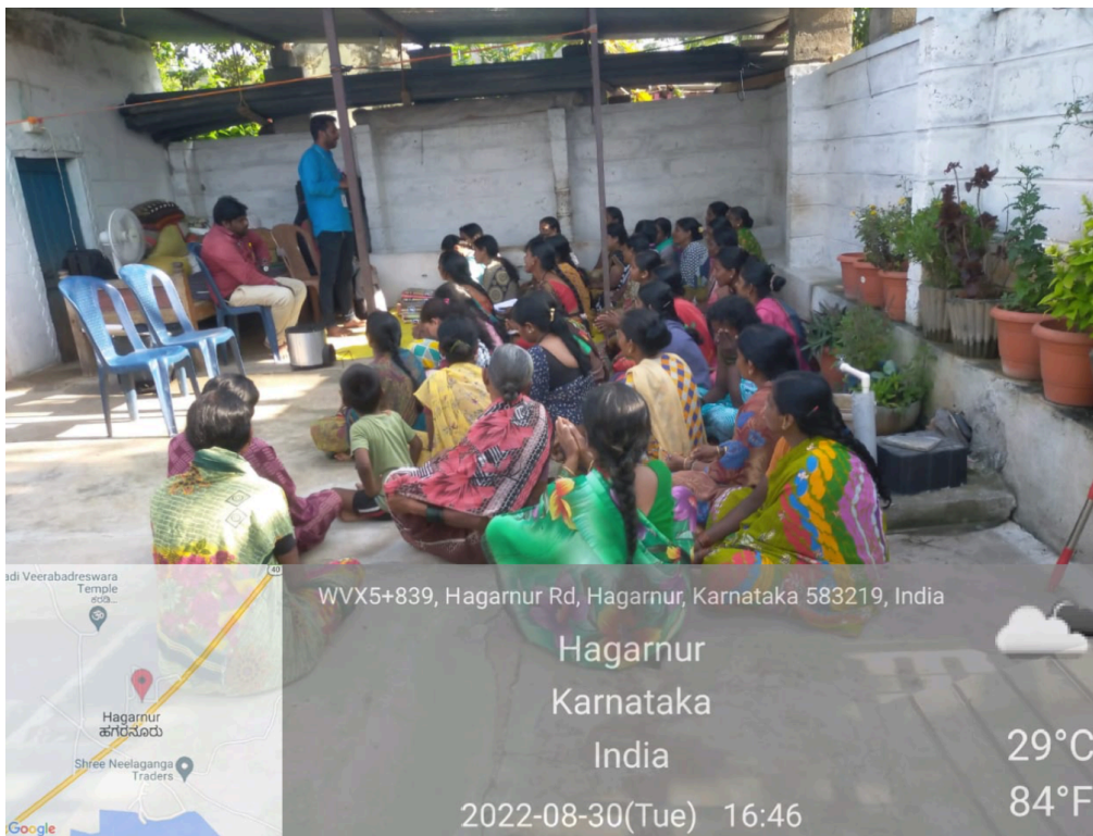
Picture of the stakeholder meeting conducted on 30/8/22, at Hagarnur