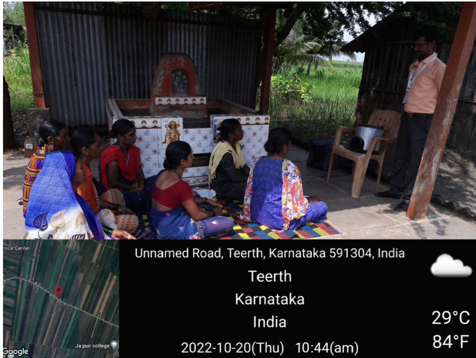
Picture of the stakeholder meeting conducted on 20/10/22, at Teerth