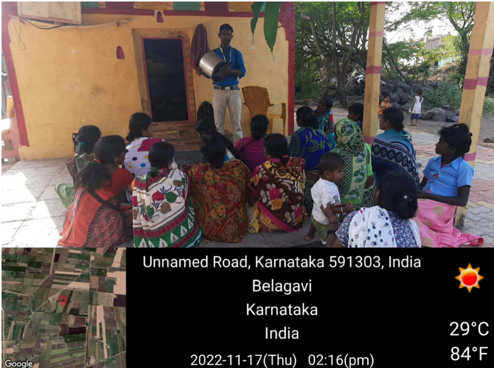
Picture of the stakeholder meeting conducted on 17/11/22, at Belagavi