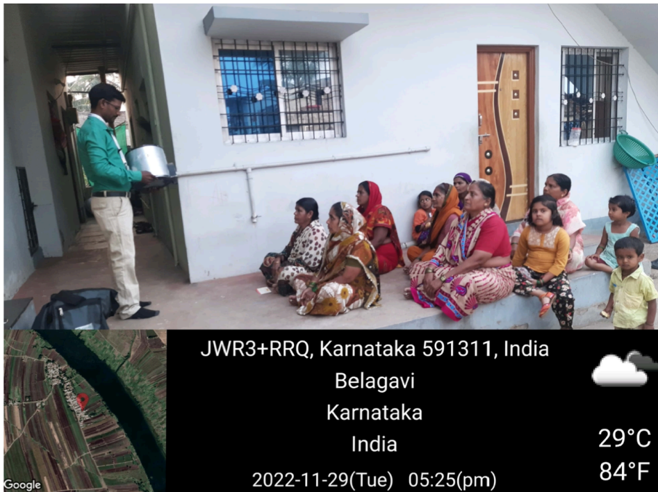
Picture of the stakeholder meeting conducted on 29/11/22, at Belagavi