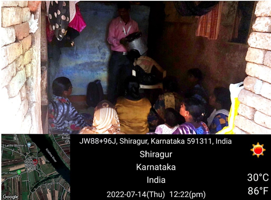
Picture of the stakeholder meeting conducted on 14/7/22, in Shiragur, Harugeri