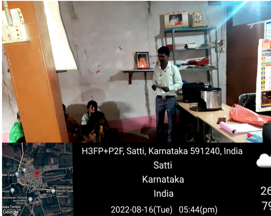
Picture of the stakeholder meeting conducted on 16/8/22, at Satti, Athani