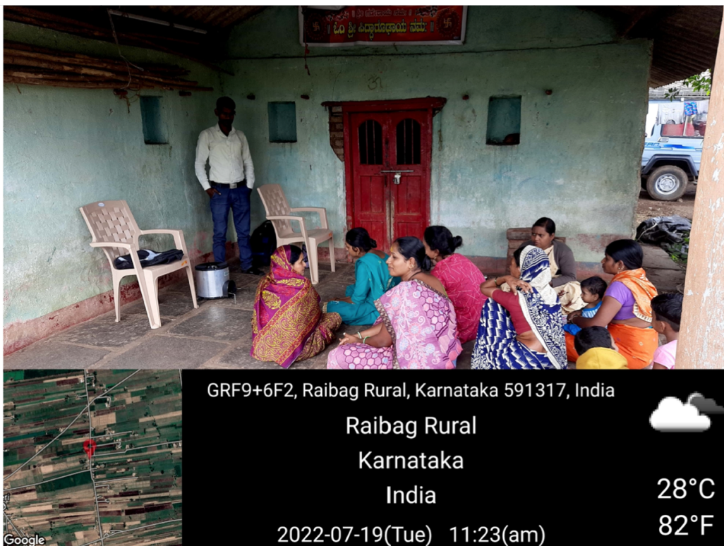
Picture of the stakeholder meeting conducted on 19/7/22, in Raibag