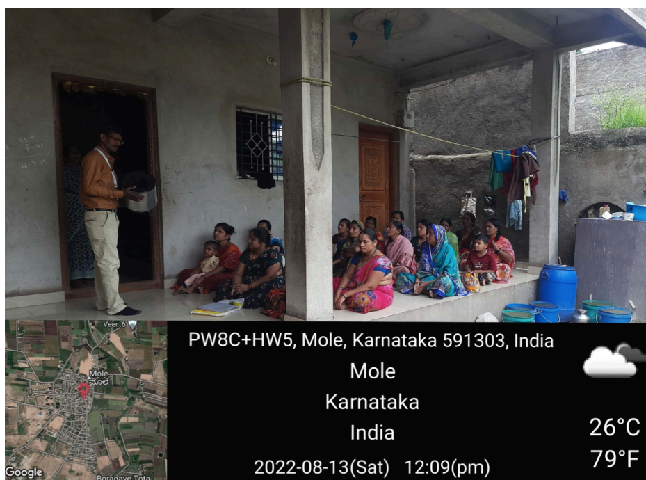
Picture of the stakeholder meeting conducted on 13/8/22, at Mole