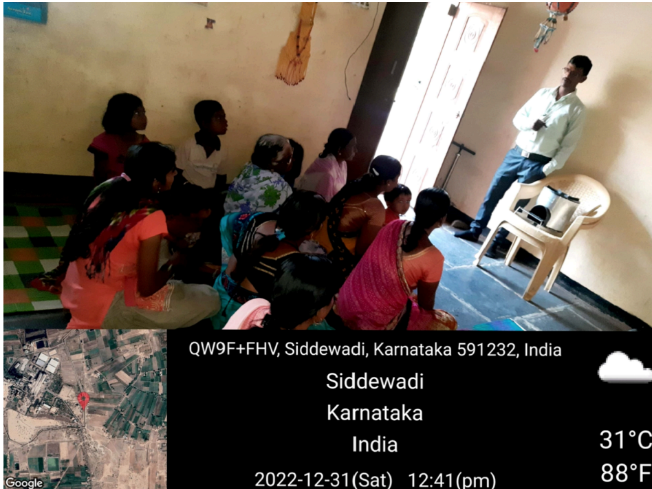
Picture of the local stakeholder meeting conducted on 31/12/22, at Siddewadi, Siddapur