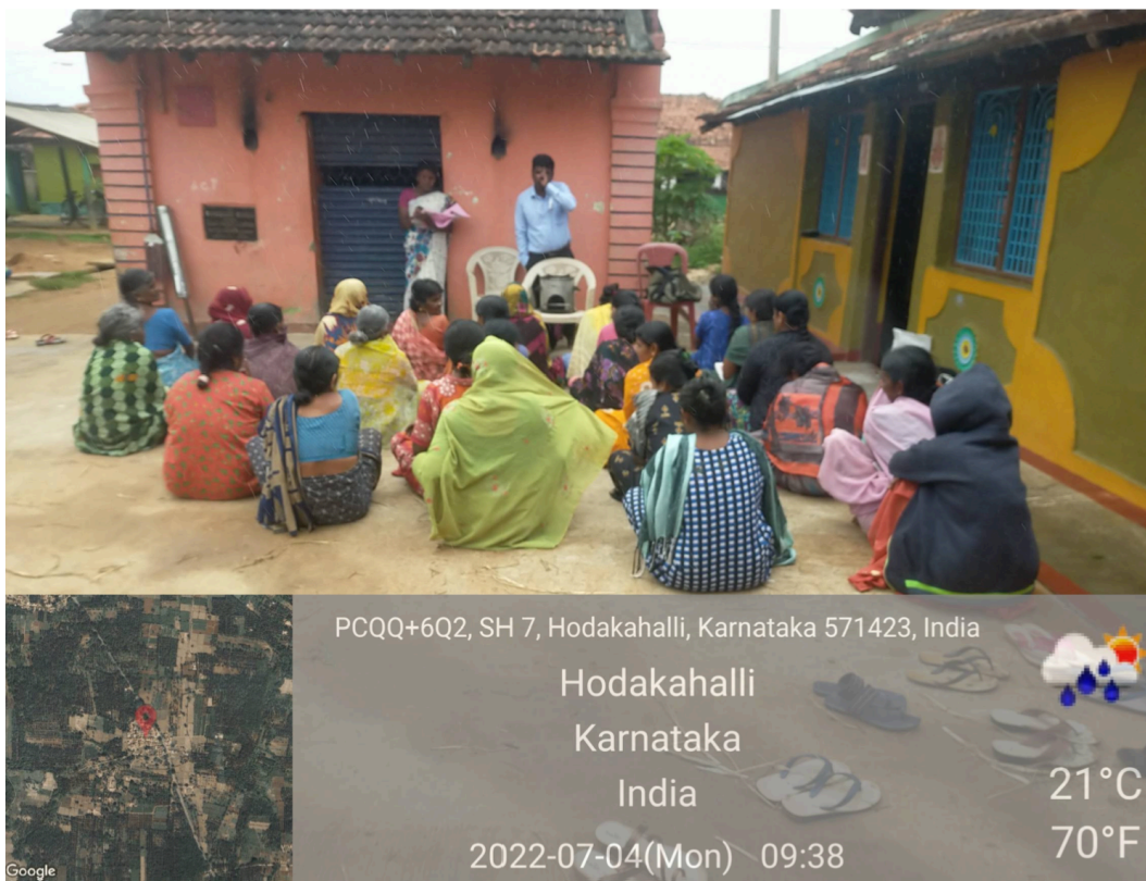
Picture of the stakeholder meeting conducted on 4/7/22, at Hodakahalli