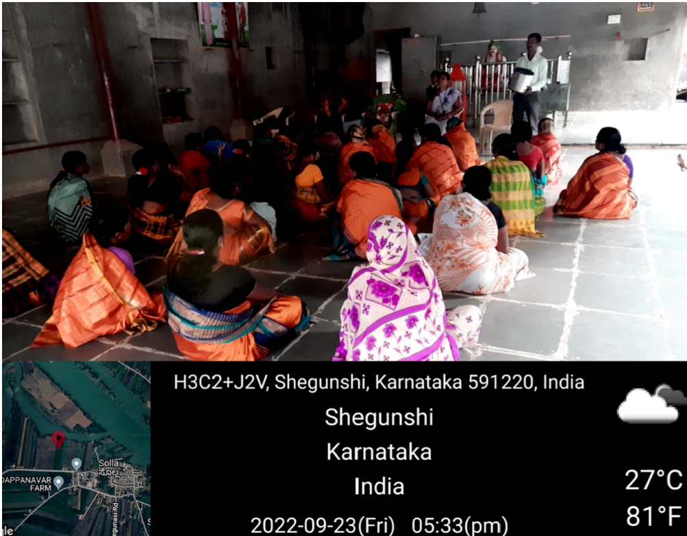
Picture of the stakeholder meeting conducted on 23/9/22, at Shegunshi