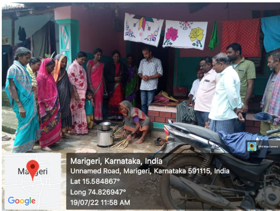
Picture of the stakeholder meeting conducted on 19/7/22, in Marigeri, Shivnanur