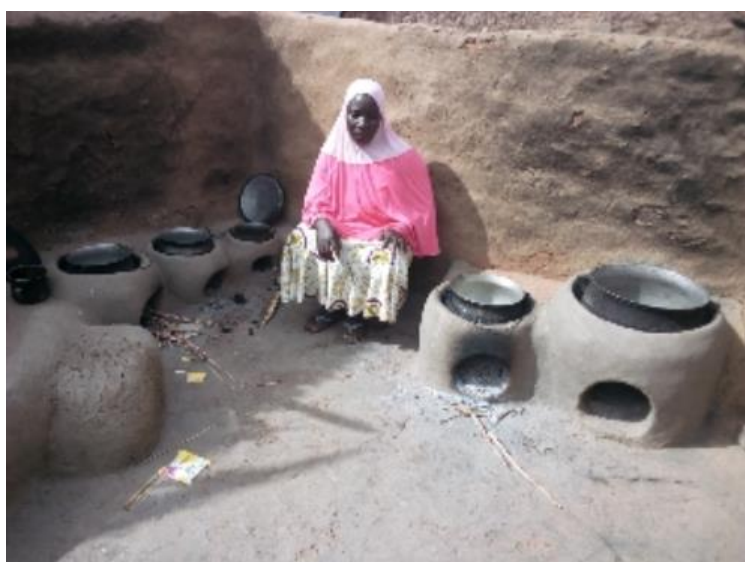
Figure: F3PA efficient cookstove

The improved technology F3PA is significantly more efficient than the traditional open fire three stone cooking method. The project activities will thus help reduce wood consumption by more than half in each household and therefore preserve the local forests and their biodiversity. This will also help combat the ever-increasing threat of desertification in the area. The F3PA efficient cookstove has further benefits such as avoiding hazardous open flame systems and reducing the quantity of harmful smoke in the local rural village households. Local families and women also benefit significantly through a reduction in time spent and distance walked in collecting wood. The project does not consist in a fuel switch as locally available wood is still being used.