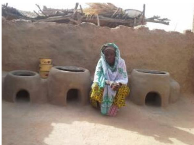
Figure: F3PA efficient cookstove

The improved technology F3PA is significantly more efficient than the traditional open fire three stone cooking method. The project activities will thus help reduce wood consumption by more than half in each household and therefore preserve the local forests and their biodiversity. This will also help combat the ever-increasing threat of desertification in the area. The F3PA efficient cookstove has further benefits such as avoiding hazardous open flame systems and reducing the quantity of harmful smoke in the local rural village households. Local families and women also benefit significantly through a reduction in time spent and distance walked in collecting wood. The project does not consist in a fuel switch as locally available wood is still being used.