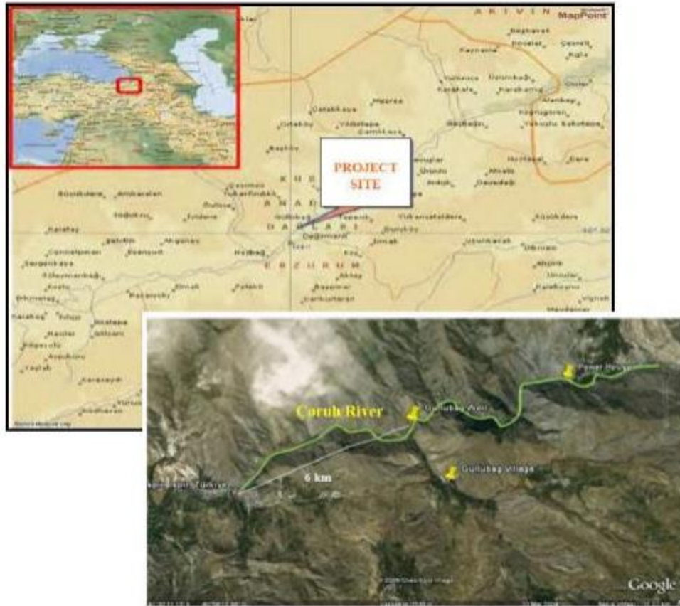
Figure 1 Location of the Project on the Map