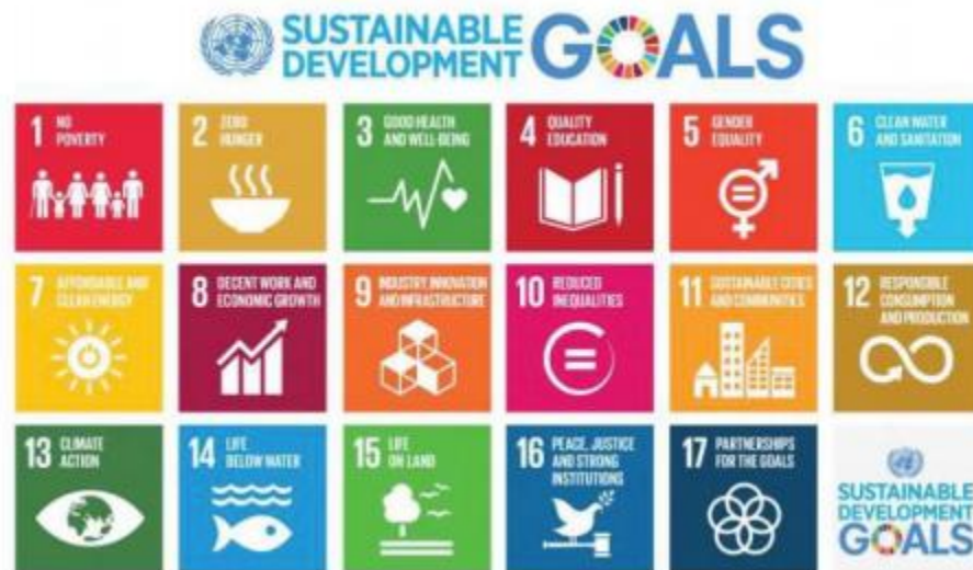
Figure 2-3. The 17 Sustainable Development Goals

The Project provides many benefits that will help achieve China's Sustainable Development Goals, a set of 17 universal goals covering the thematic areas of environmental, economic and social development (Figure 2-3).