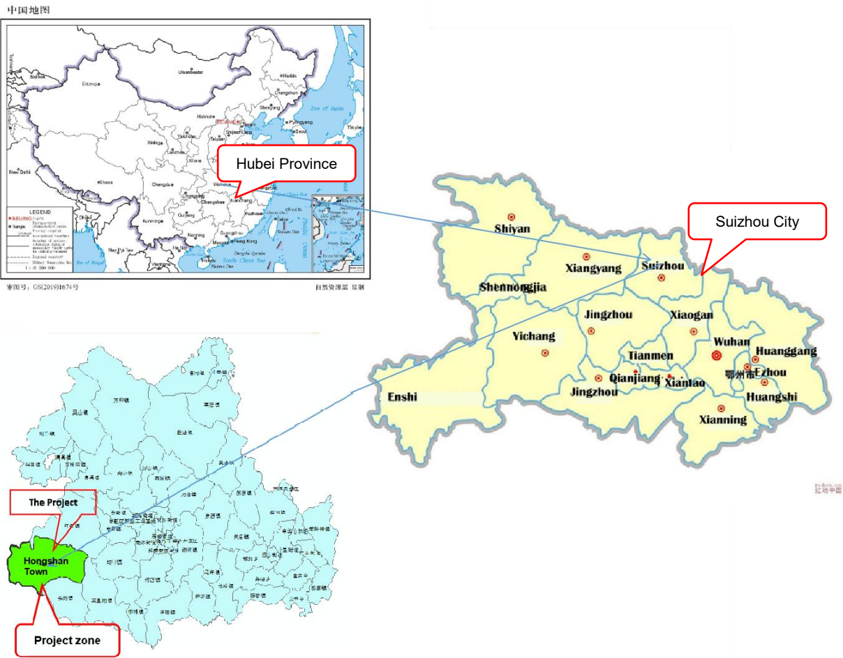
Figure 2-1: The project location and project zone