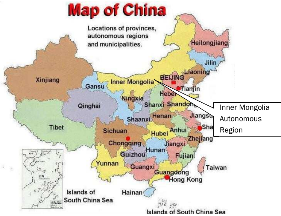
Figure 1. Location of Inner Mongolia Autonomous Region in China