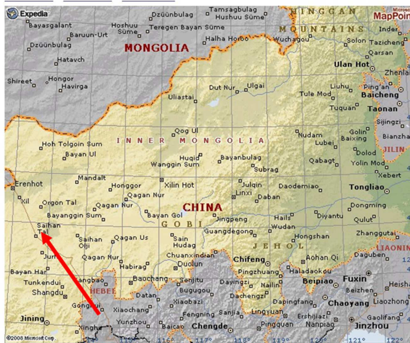
Figure 2. Location of the project