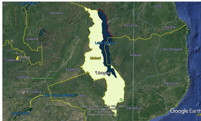
Map of project area

Map: http://www.ephotox.com/malawi_region_map.html Geographical coordinates obtained from Google Earth®