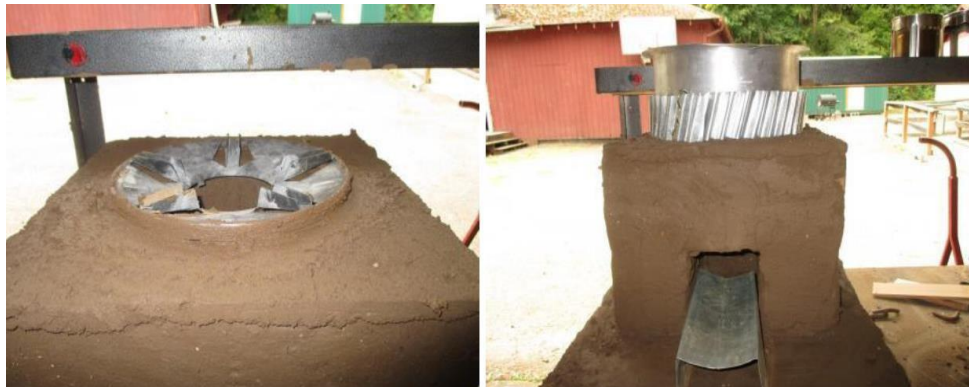
TLC-CQC Rocket Stove

TLC-CQC Rocket Stove uses a total of 16 bricks that will be made by the households using locally available clay. The average size of the brick would be 22.5cm x 11cm x 6.5cm. The bricks will be joined together using a mixture of 5 liters clay, 5 liters sand, 5 liters manure/cow dung and 5 liters of water. This ensures reduction in heat loss and better insulation. Metal components have been added to the design to optimize combustion and heat transfer.