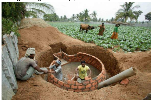
Figure 1: DeenBandhu Biogas plant model under construction.

In each household, a Deen Bandhu Biogas plant model together with a biogas-based cooking stove unit will be installed. The biogas units are constructed of bricks, sand, cement, pipes, pipe fittings, metal clips, wire and gas burners. Each bioreactor is a mesophylic fixed dome. The capacity of the bio-digesters is either 2m 3 or 3m 3 of biogas per day. The biogas unit size for a particular household is chosen based on the number and type of cattle owned by the household and the number of people in the household. Cattle dung and wastewater is fed into the biodigester daily. Cattle dung and kitchen wastewater is added to a mixing tank above ground which has an inlet pipe to a digester chamber which is below ground. The dung and wastewater slurry remains in the chamber for approximately 40 days and breaks down anaerobically producing biogas. This biogas builds up above the slurry and remains in the chamber until it is released through the gas outlet pipe at the top of the dome when the gas burner in the household is turned on.