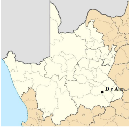
Figure 1.7-1: Location of De Aar in the Republic of South Africa