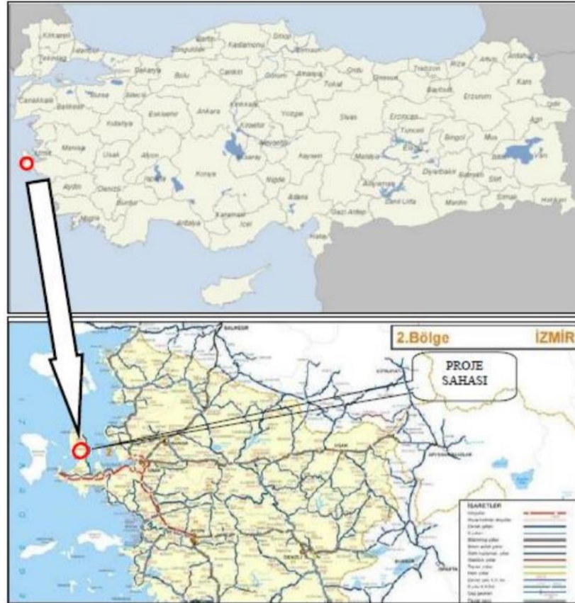
Figure 1. Location of Mordoğan Wind Power Project