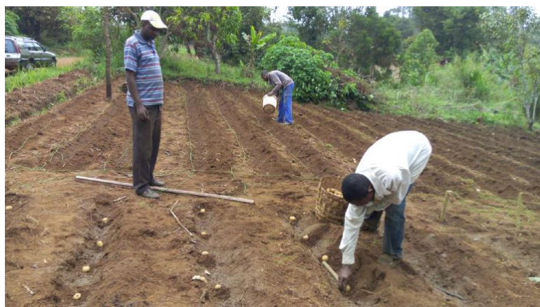
Farmers growing potatoes using Compost as soil amendment