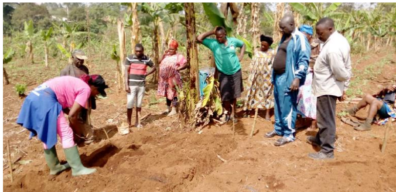
One of the examples of the Farmers training on the Compost application

This compost is used by local communities as a soil amendment. It allows them to feed crops and build soil fertility.