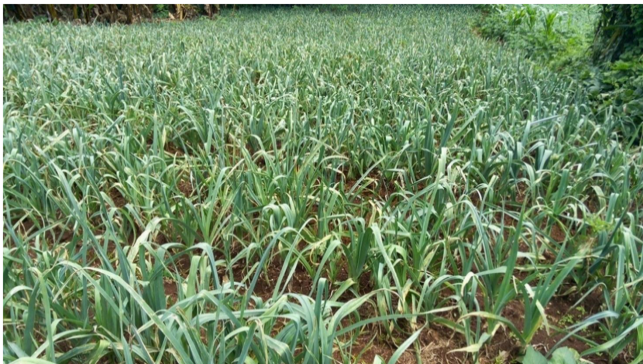
Growing cultures thanks to Compost used as soil amendment.