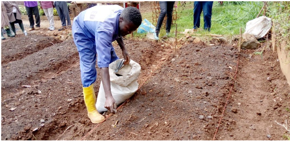
One of the examples of the Farmers training on the Compost application

This compost is used by local communities as a soil amendment. It allows them to feed crops and build soil fertility.