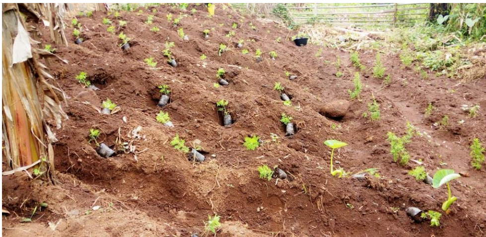
Growing cultures thanks to Compost used as soil amendment