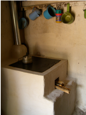
Traditional La Justa stove