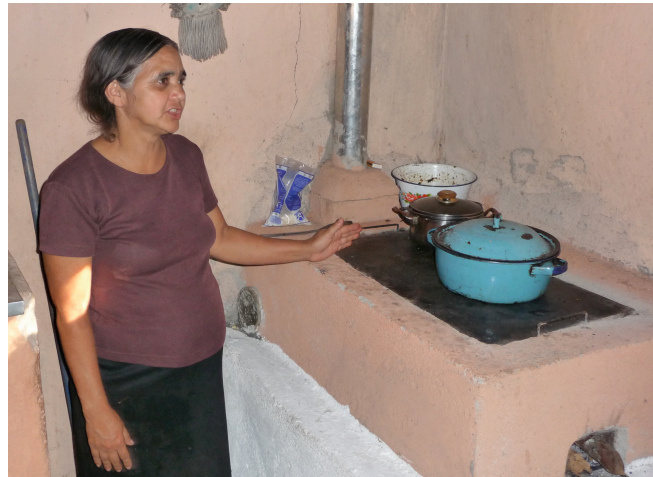
New Estufa Dos por Tres stove