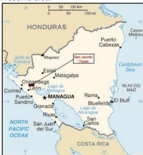
Figure 1. Map of Nicaragua showing project location

distance north of the base camp, and provides access to the site. The plants will be installed at an altitude of 200 metres above sea level. The wells will be located between 160 and 180 metres above sea level in the San Jacinto area.