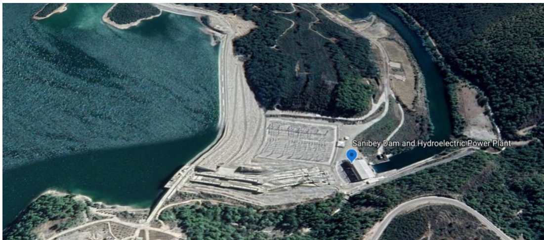
Figure 1: Satellite image of the Project

The following figures show the project's location.