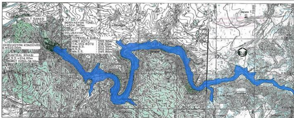
Figure 3: Plant Layout