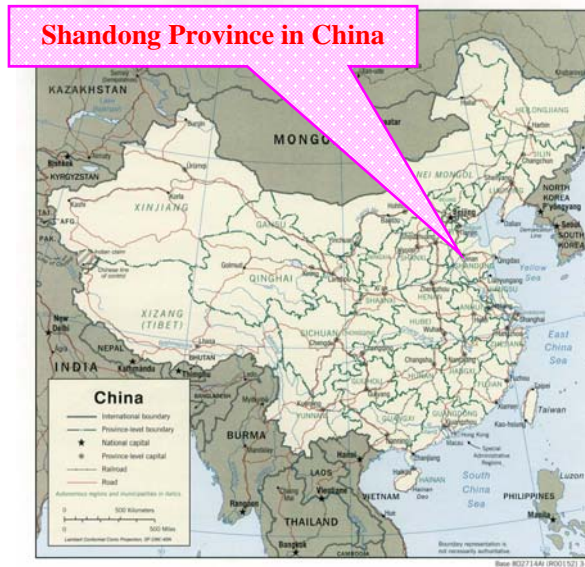
Figure A-1: Location of the Shandong Province in China