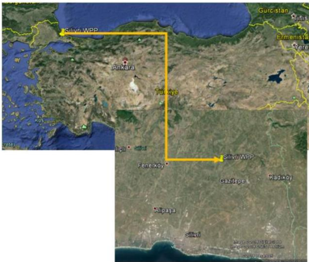
Figure 1. Project Location on Türkiye Map