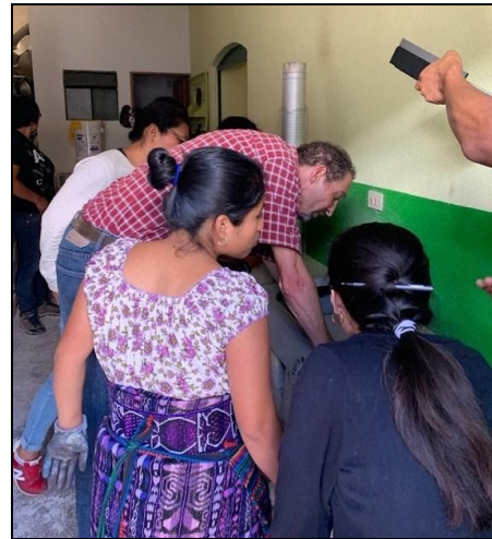
Figure 3: TRL holds a training for ODIM on December 12, 2019

Past public events and expositions motivated the following actions by TRL: