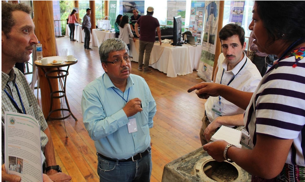
Figure 2: TRL consults with a stakeholder at the Second Annual International Symposium on Continental Waters of the Americas.

OUTCOMES: TRL was able to gather useful feedback from several stakeholder groups, including representatives of social and environmental public-sector agencies as well as civil society organizations, and use it to modify the project design. Please find here some examples of feedback: