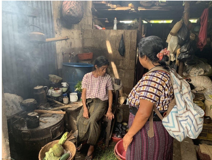
Figure : Open cooking fires generate ambient air pollution levels that are highly hazardous to human health.

disease according to the WHO. The fire on the floor is a burn risk for small children who can fall into it. Women are exposed to the flames while cooking and often one can see discoloration of the skin on the arms and legs of women who cook on an open fire.