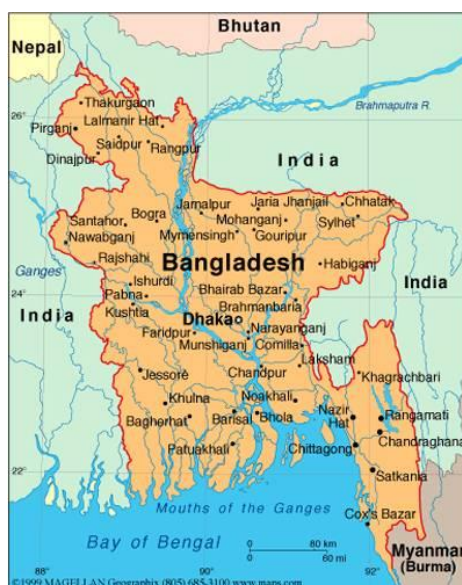
Figure 1: The geographic boundary of the VPA – the People’s Republic of Bangladesh

Physical Geographical location: The geographical boundary of Bangladesh is depicted by the map given below.