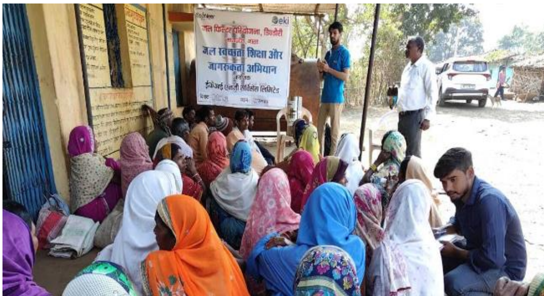
Fig: Beneficiary awareness training program

The fields execution team works in close collaboration with the project participant to develop a training manual that clearly lays out rules and procedures for all activities related to data recording, archiving and preparation of monitoring reports. Also, CME conducted beneficiary training frequently to provide the proper awareness and guidance