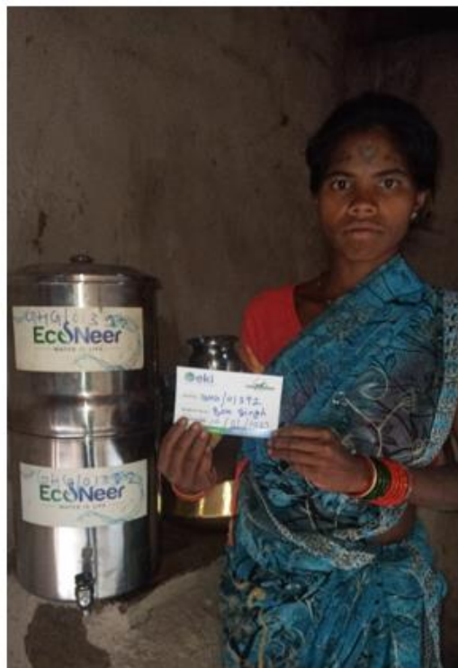
Econeer water purifier for safe drinking water

The objective of the project consists of reducing greenhouse gas emissions and providing better living conditions at households, especially improving the health of women and children by reducing indoor air pollution.