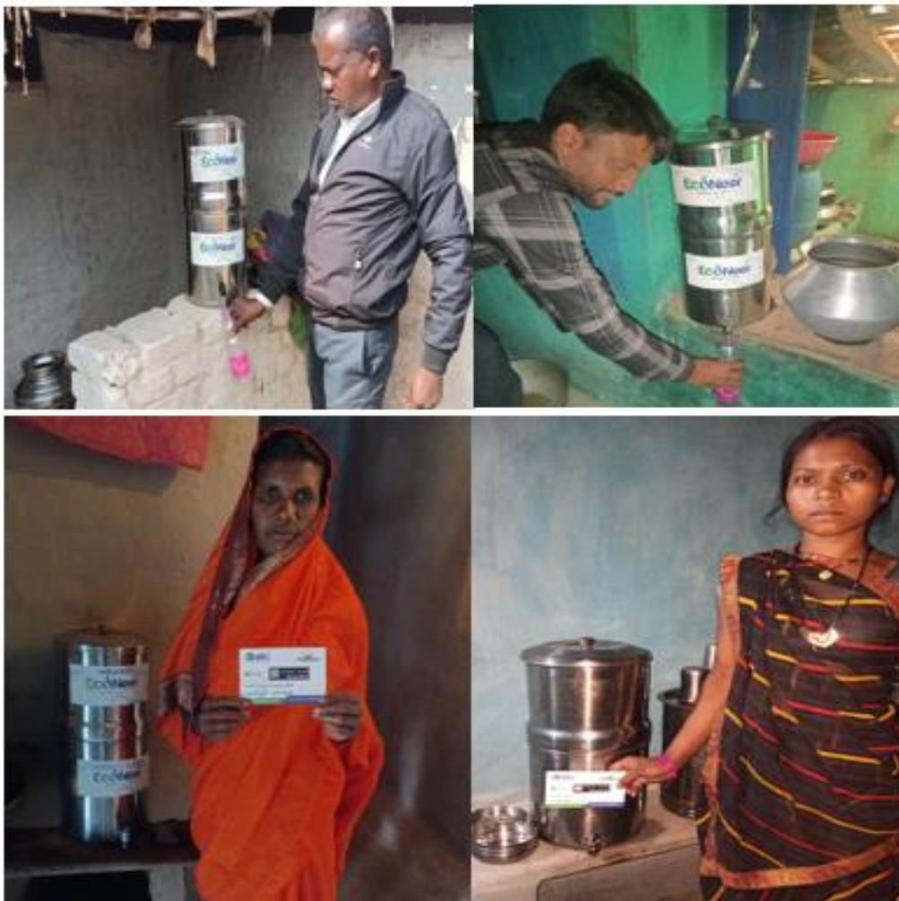
Fig: Examples of the Water Purifier units being used in the project

The water purifier distributed in this project have a unique number, and during use, due to the quality of the water purifier itself, the project owner is responsible for the