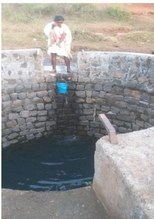
Pre-project Scenario for drinking water

The real case VPA under the GS-POA is providing safe water treatment solutions (HWT) for marginalized households at free of cost and replace the usage of equivalent amount of fuel wood being required to boil water in traditional three stone fire or any other wood stoves which are inefficient and smoke-intensive which would have been used to make it safe for drinking purposes. The project is disseminating safe drinking water technologies (HWT units i.e. Econeer) for households.