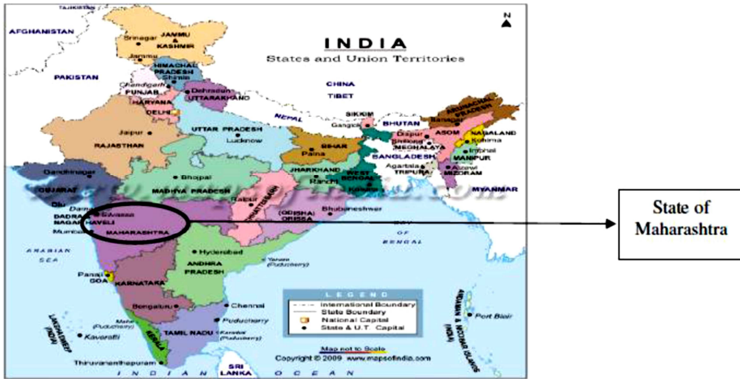
Fig 1: Map of India indicating the location of state of Maharashtra