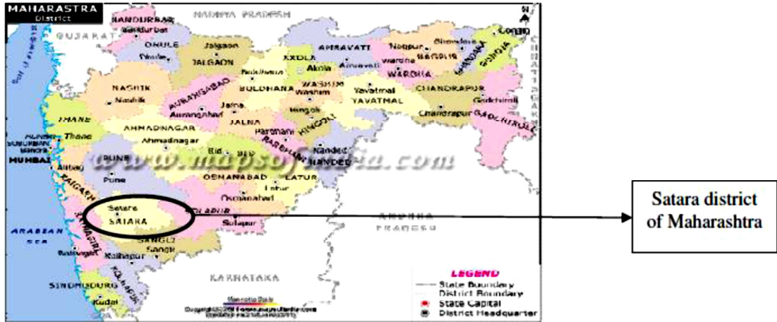
Fig 2: District map of state of Maharashtra