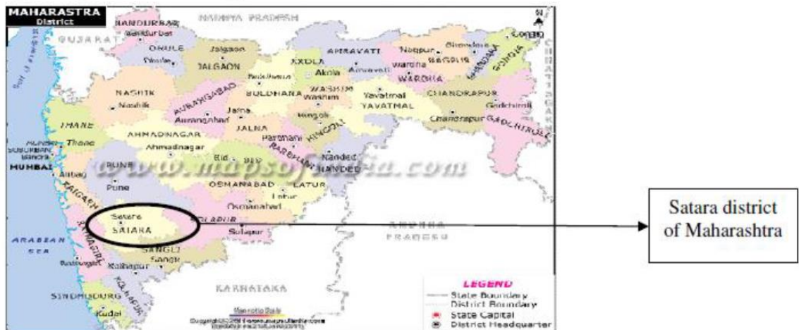
Fig 2: District map of state of Maharashtra