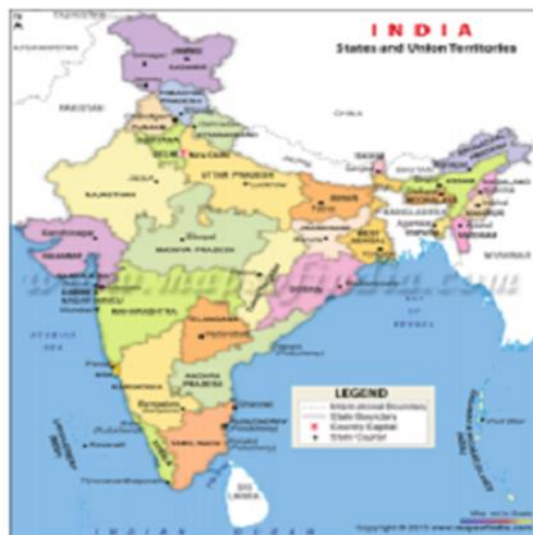
Figure 1. National Boundary