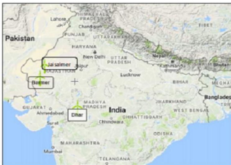
Figure 2. Image showing project locations